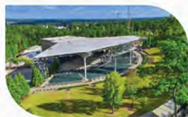
AMERIS BANK AMPITHEATER Renowned outdoor venue hosting a variety of major concerts and events