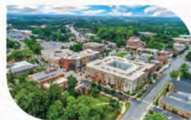
CITY CENTER Downtown mixed-use district surrounded by landscaped parks