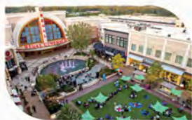
AVALON Premier mixed-use development with living, retail and dining