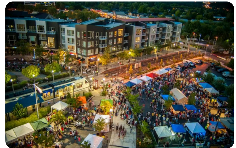
Beaverton Night Marketing