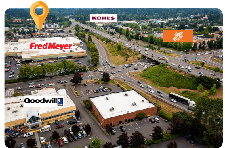
Subject property in relation to major retailers

Beaverton itself is a thriving city with a strong sense of community and a focus on growth. The city hosts a number of annual events , such as the Beaverton Farmers Market, the Beaverton Night Market, and the Tualatin Hills Park & Recreation District events, which draw large crowds to the area . These events not only bring in more visitors but also increase the visibility of businesses within the vicinity. With the growing popularity of the city and its active, family-friendly atmosphere, 11350 SW Canyon Rd sits in an area with excellent long-term potential for sustained high traffic and visibility .