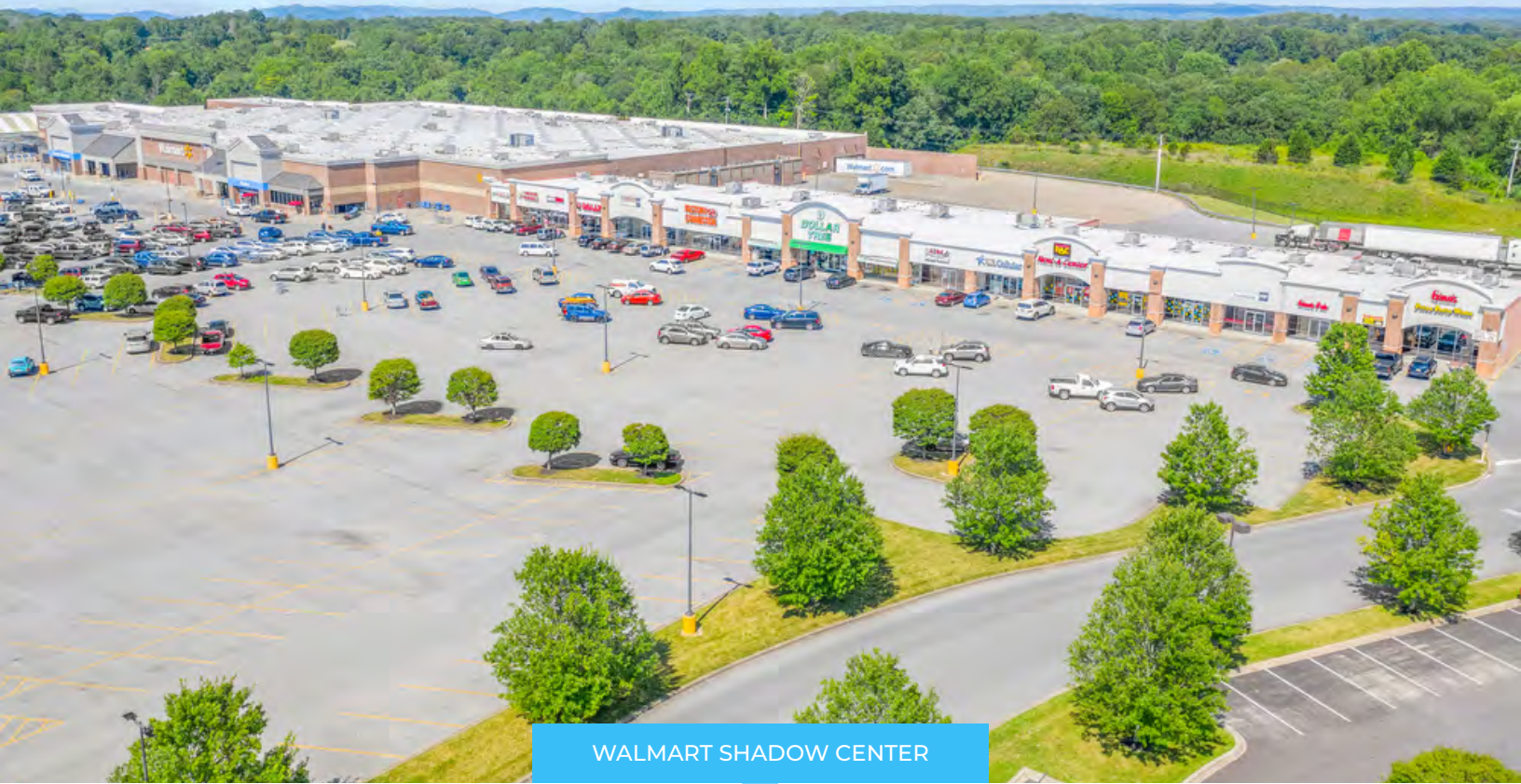
WALMART SHADOW CENTER