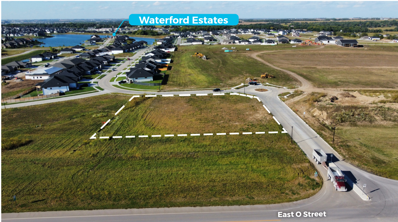
Note: All dimensions are approximations and are not guaranteed. Please field verify all measurements.