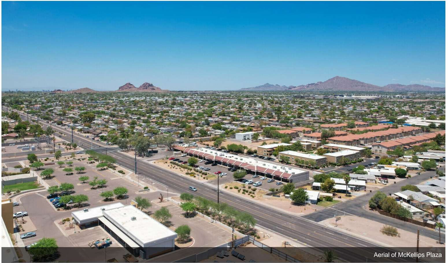
Aerial of McKellips Plaza