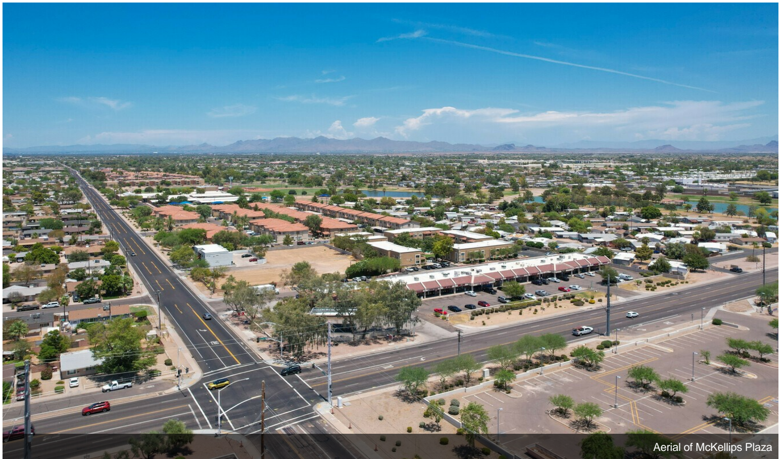
Aerial of McKellips Plaza