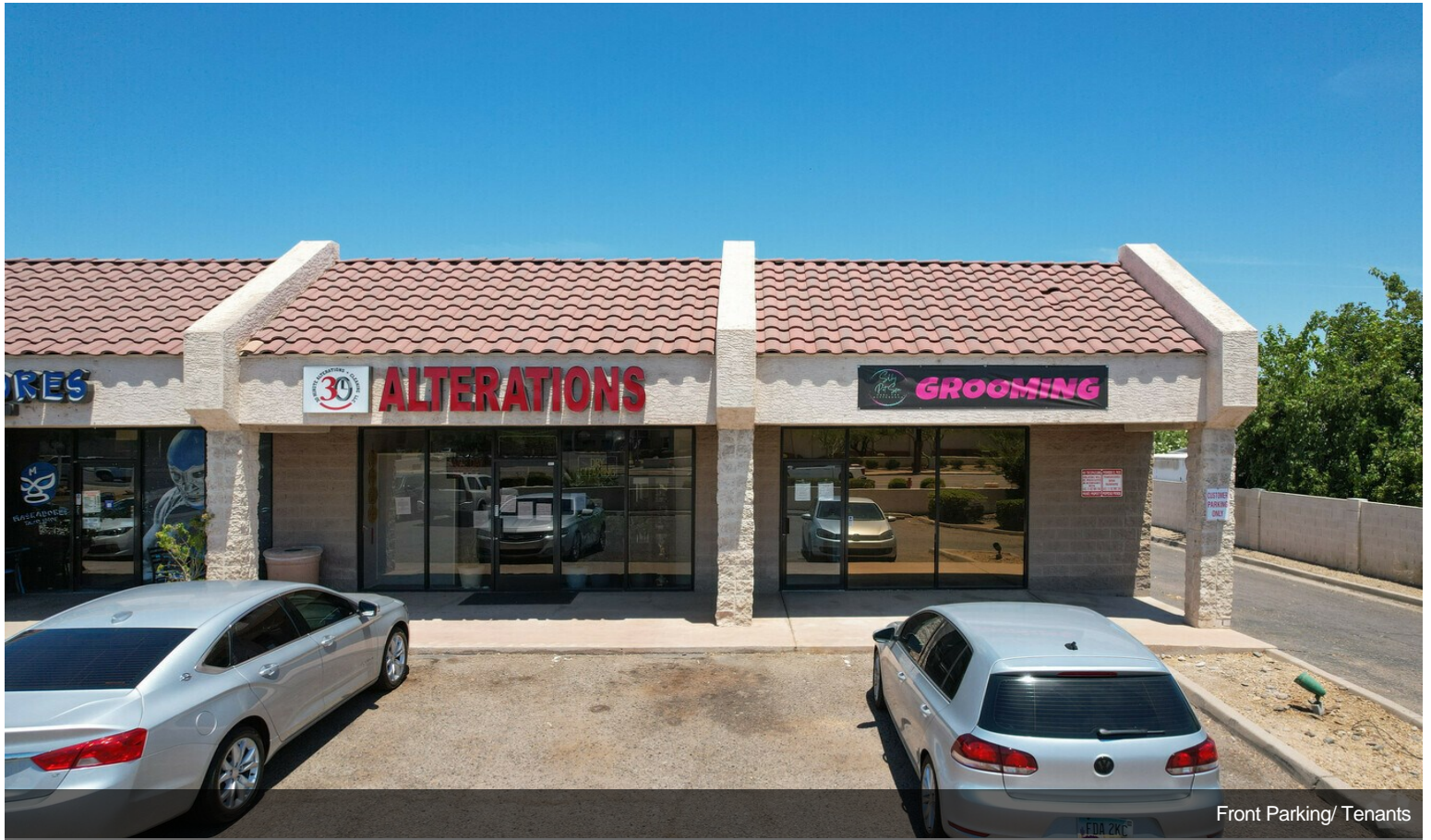
Front Parking/ Tenants