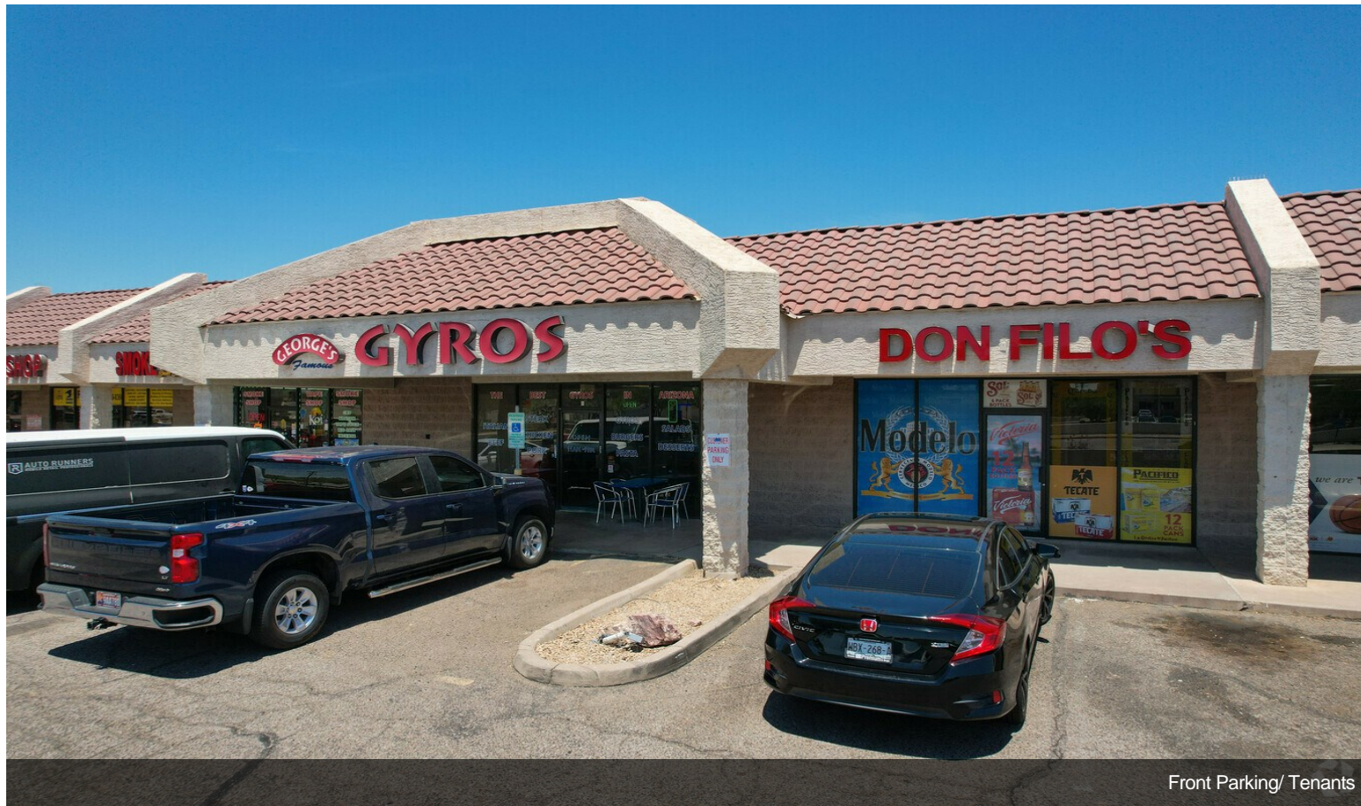
Front Parking/ Tenants