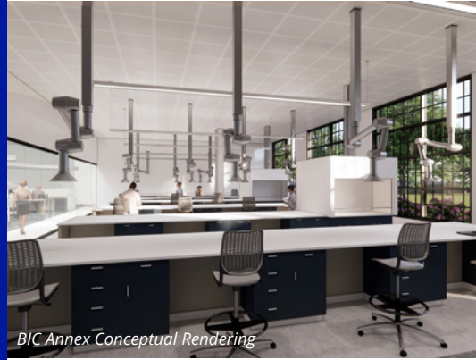
BIC Annex Conceptual Rendering

Offering the largest white box manufacturing spaces available for immediate buildout in Philadelphia today and biomedical workforce training programs delivered direct on site, the Budd Bioworks is a partner that can support and scale your curures, moving our partner firms towards the goals of tomorrow.