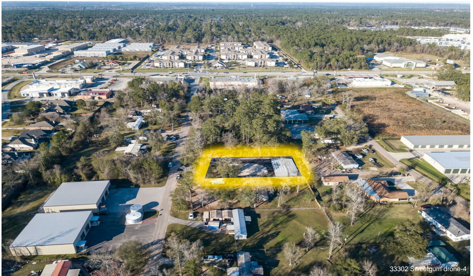
33302 Sweetgum drone-4