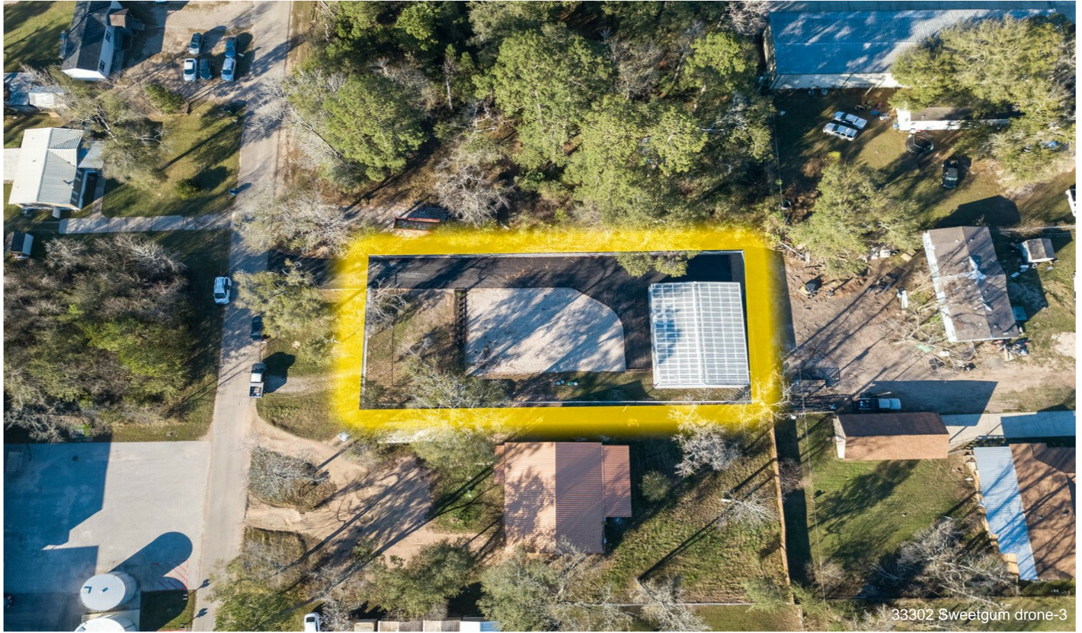
33302 Sweetgum drone-3