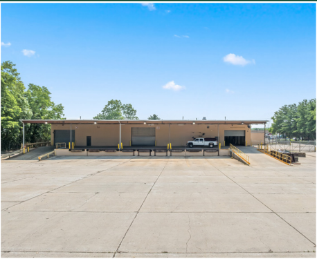
9 DOCKS + 2 RAMPED DRIVE INS