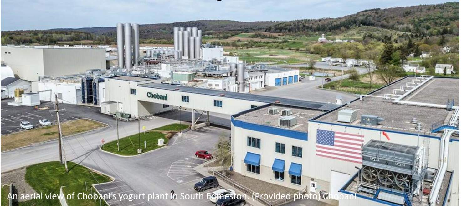
An aerial view of Chobani's yogurt plant in South Erneston.

Chobani to invest $1.2 billion into building a 1.4 million square-foot dairy processing plant at Griffiss Business and Technology Park — the largest investment in natural food manufacturing in the United States. The Triangle Site, measuring around 332 acres at Griffiss International Airport, will house the new Greek yogurt manufacturing facility. Chobani aims to create more than 1,000 jobs in Oneida County, nearly doubling Chobani's New York State workforce.