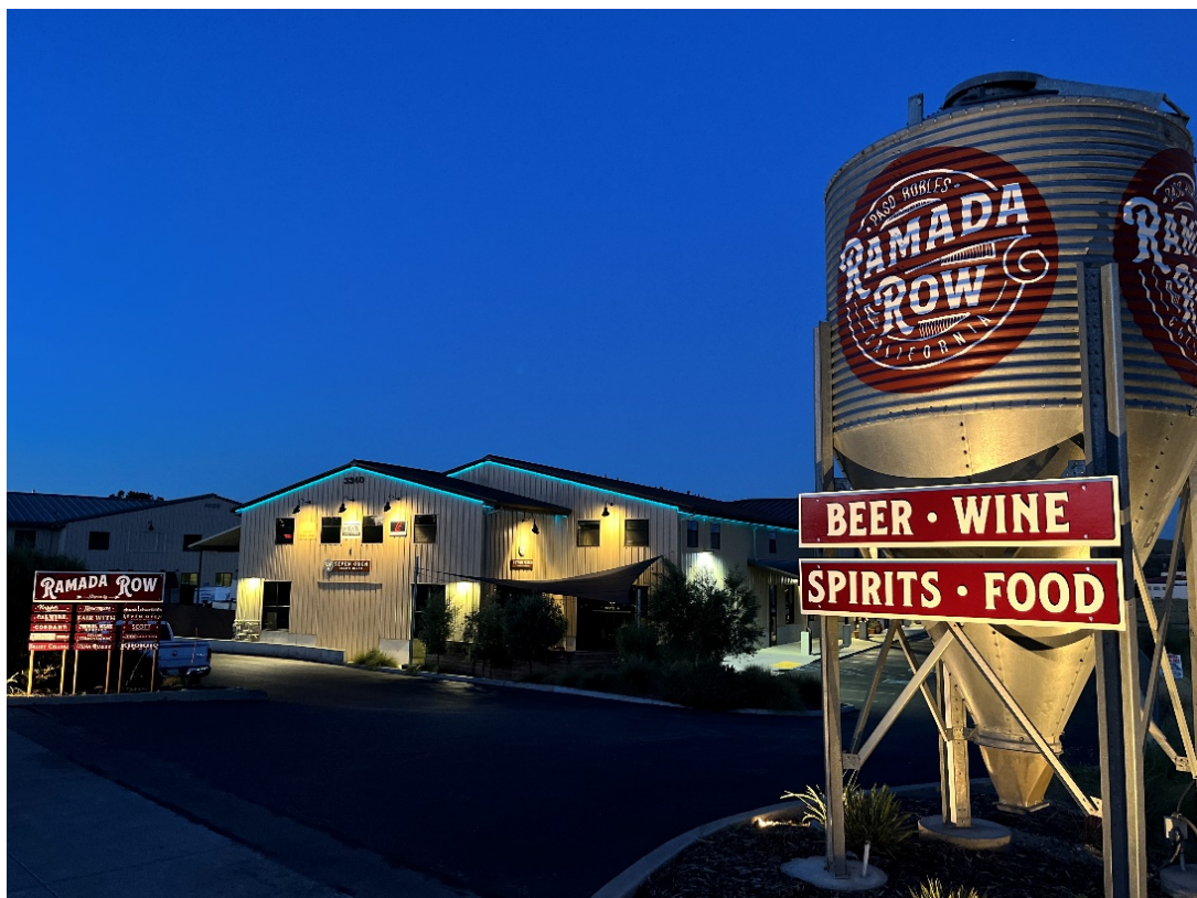
Ramada Drive Entrance with 101-Freeway Visible Signage and Landmark