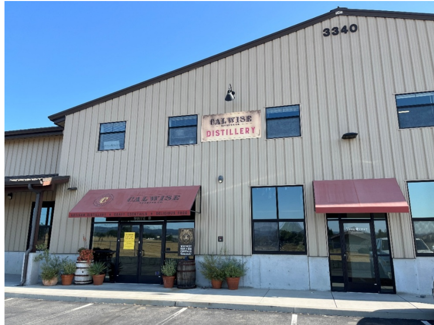
Exterior of Suite

4,451 Sq Ft Space Available Mid November 2025