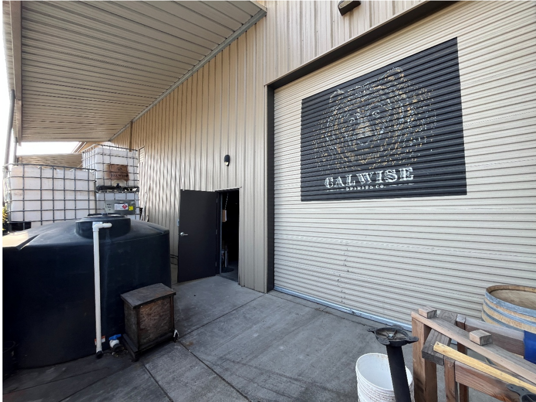
Fenced & Covered Yard Area