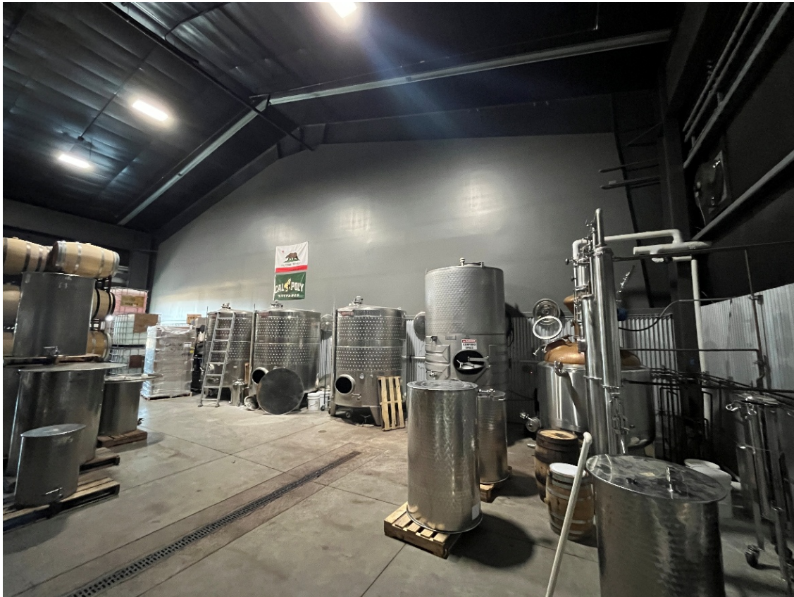
Warehouse / Production Space