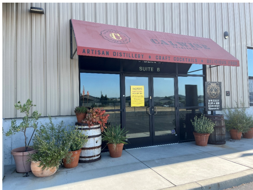
Tasting Room Entry