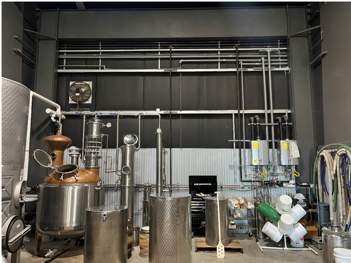
Warehouse / Production Space