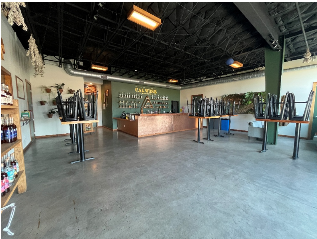
Tasting Room / Retail Space