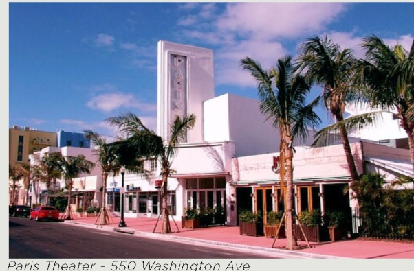
Paris Theater - 550 Washington Ave