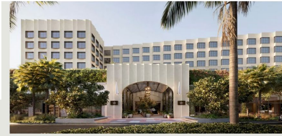
Goodtime Hotel - 601 Washington Ave

Goodtime Hotel, a David Grutman and Pharrell Williams collaboration, opening 2021 complete with a 40K SF outdoor pool deck, fine dining and a recording studio for artists visiting/ living in Miami Beach (266 Rooms)