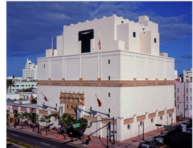
Wolfsonian Museum - 7007 Washington Ave

Thompson Hotel: 150 Rooms hotel will be adjacent to the New World Center and Miami Beach Convention Center