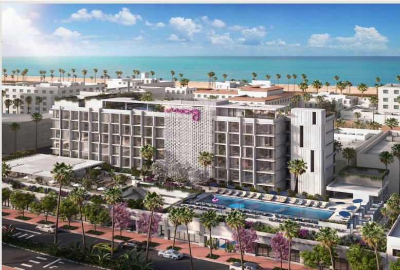
Moxy Hotel - 975 Washington Ave

Washington Avenue is one of the best-known streets in South Beach. Running parallel with Ocean Dr and Collins Ave, it is one of the main north-south corridors of South Beach.