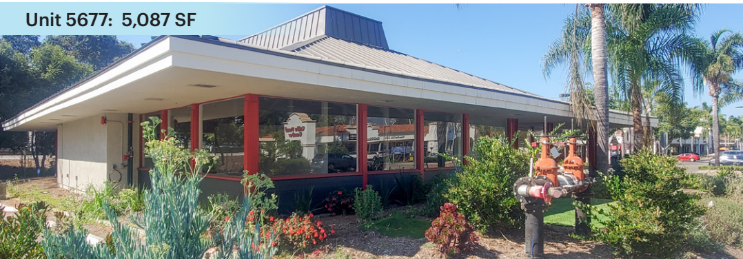
Unit 5677: 5,087 SF