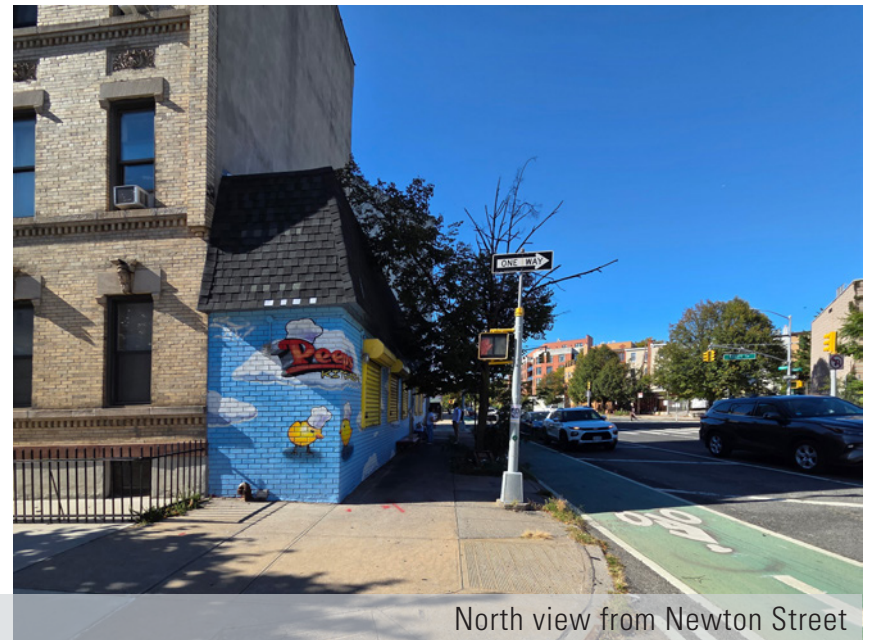
North view from Newton Street