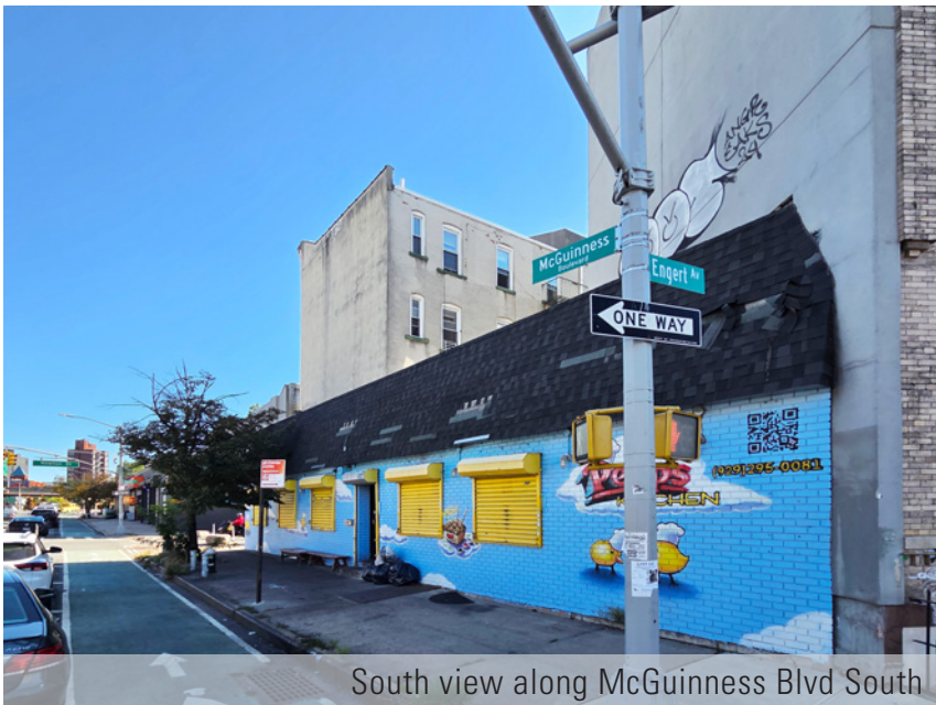
South view along McGuinness Blvd South