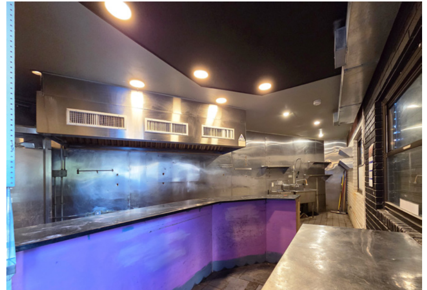
Vented cooking area