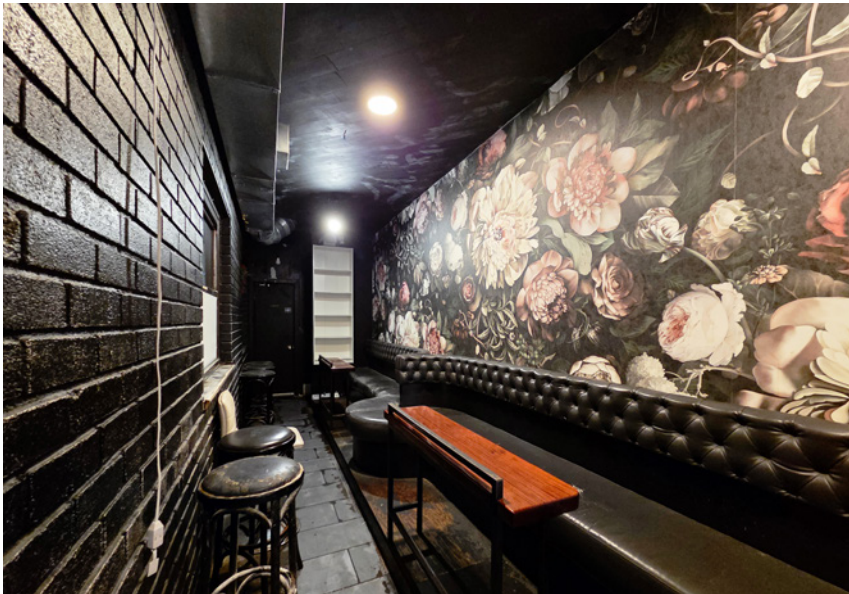
Interior View - non-cooking area