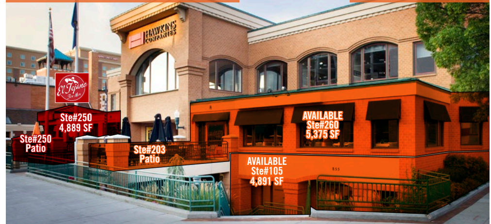
Ste#105 – 4,891 SF