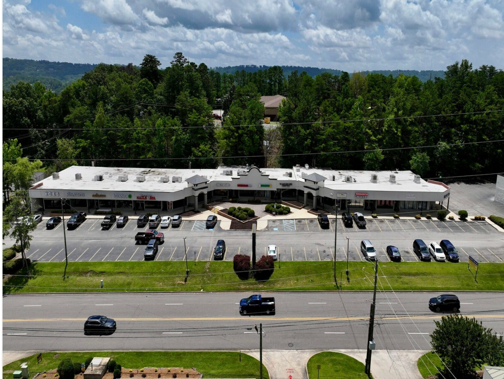
West Valley Ave. street view