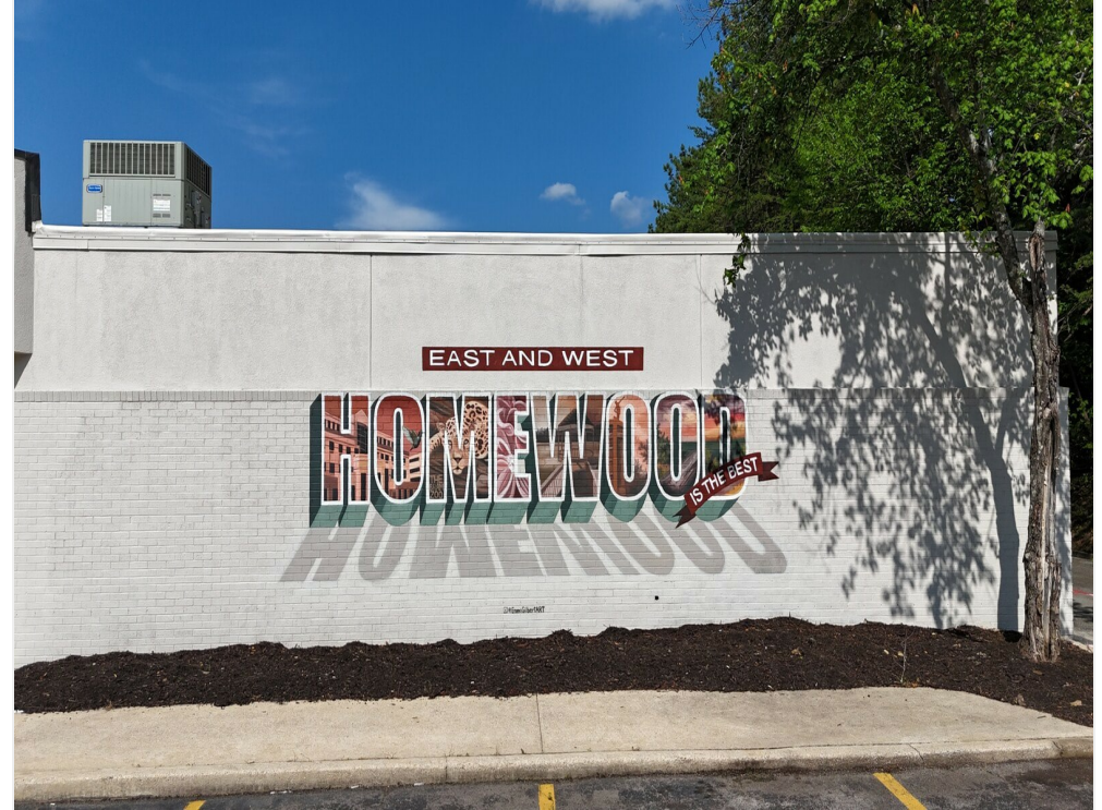
Homewood famous mural