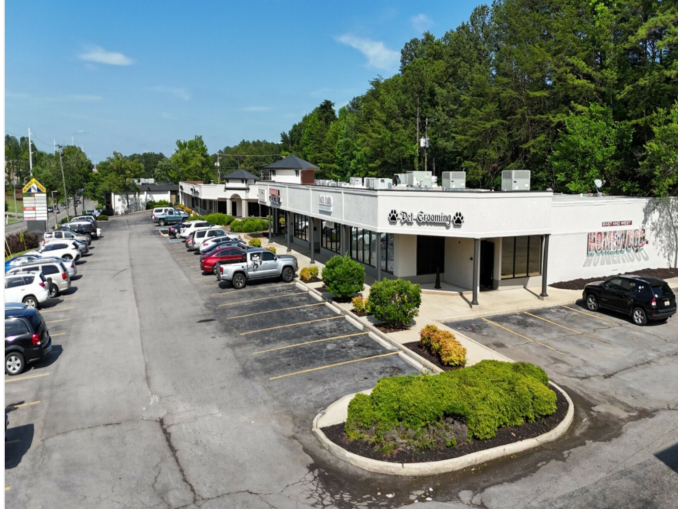
Parking lot view