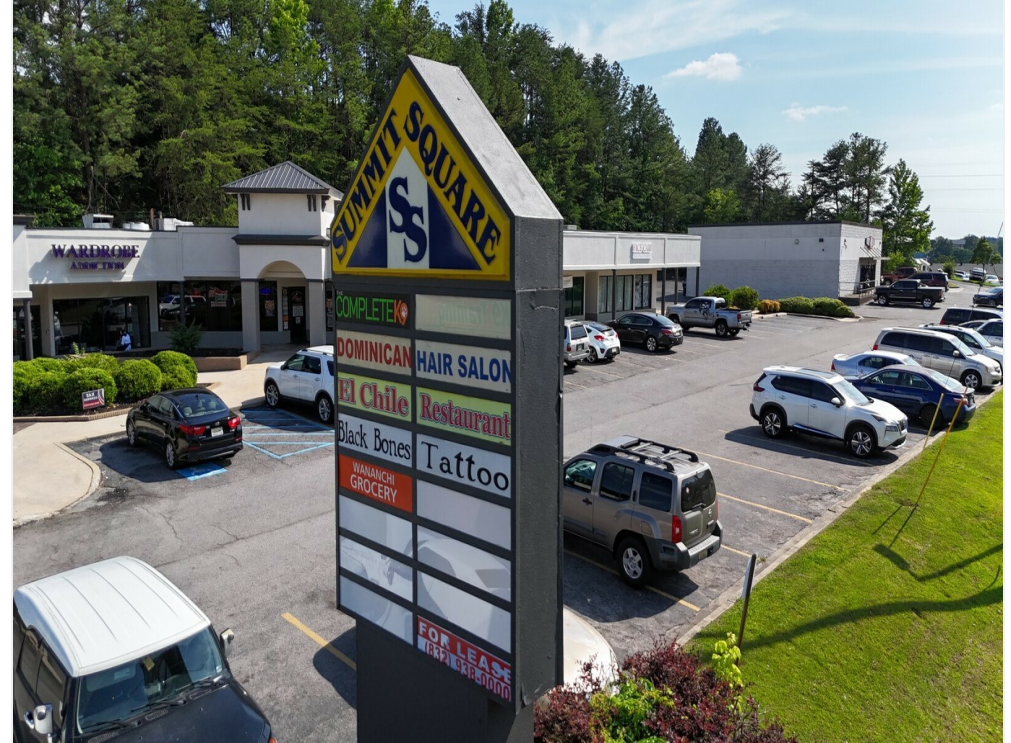
Shopping Center Pylon Sign