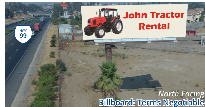
North Facing Billboard: Terms Negotiable

Fully signalized intersection planned for Cornelia and Shaw Avenues. Subject to change, Tenant to verify.