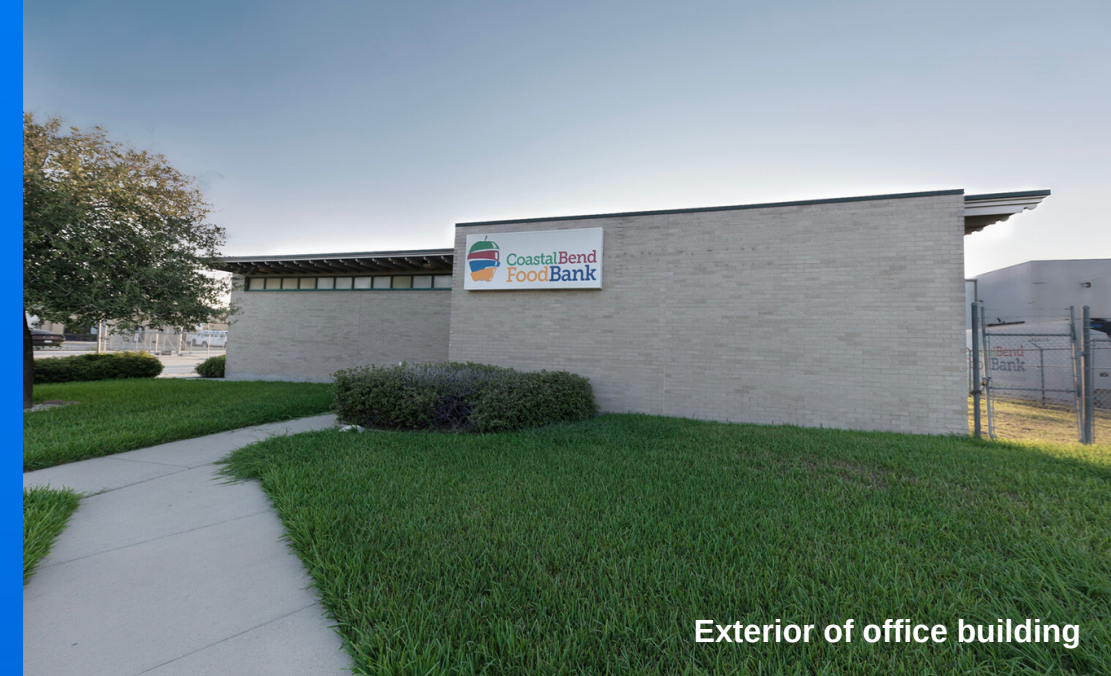
Exterior of office building