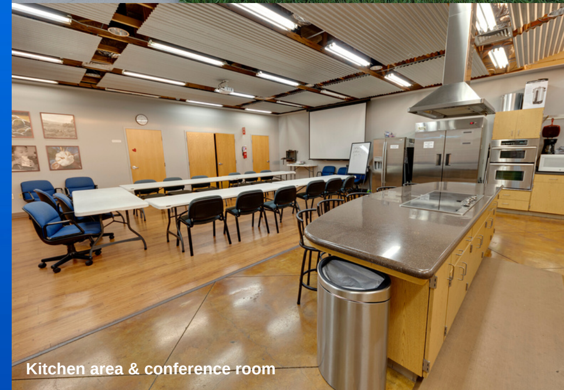
Kitchen area & conference room