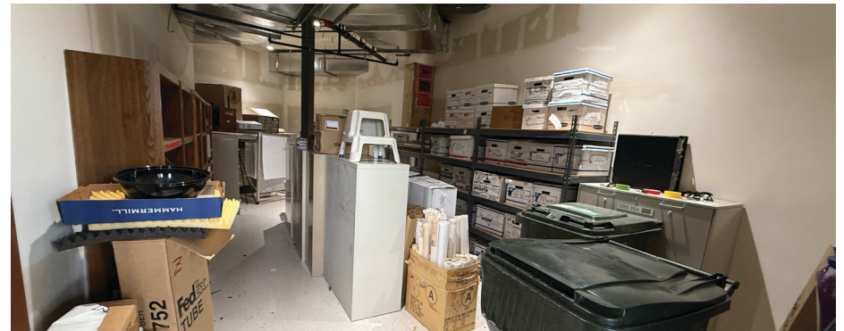
ADDITIONAL STORAGE SPACE (SECOND FLOOR)