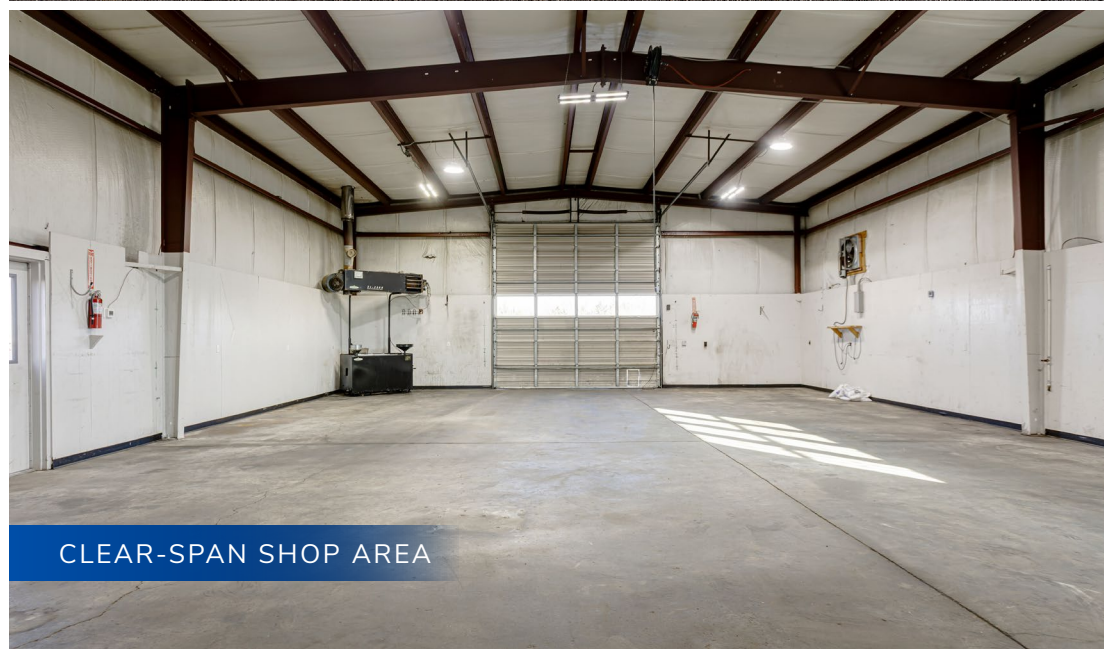
CLEAR-SPAN SHOP AREA