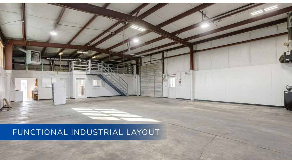
FUNCTIONAL INDUSTRIAL LAYOUT