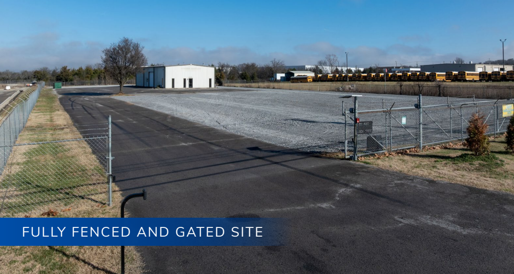
FULLY FENCED AND GATED SITE