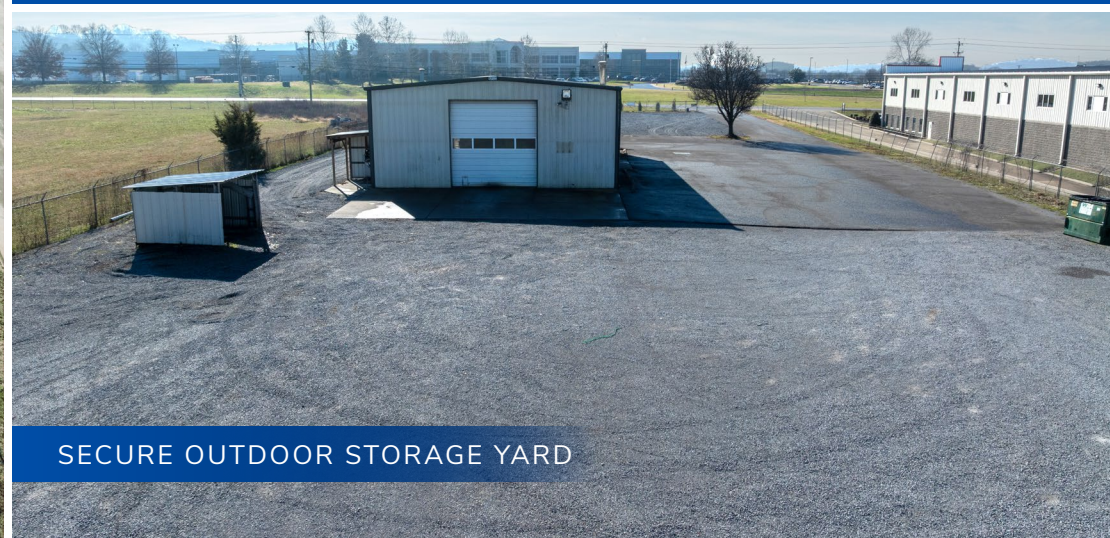
SECURE OUTDOOR STORAGE YARD