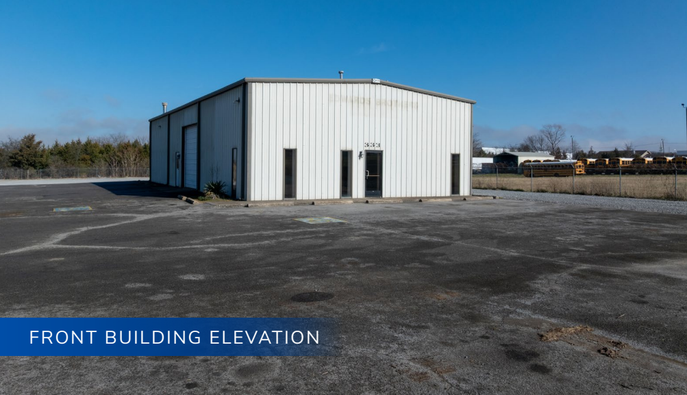
FRONT BUILDING ELEVATION