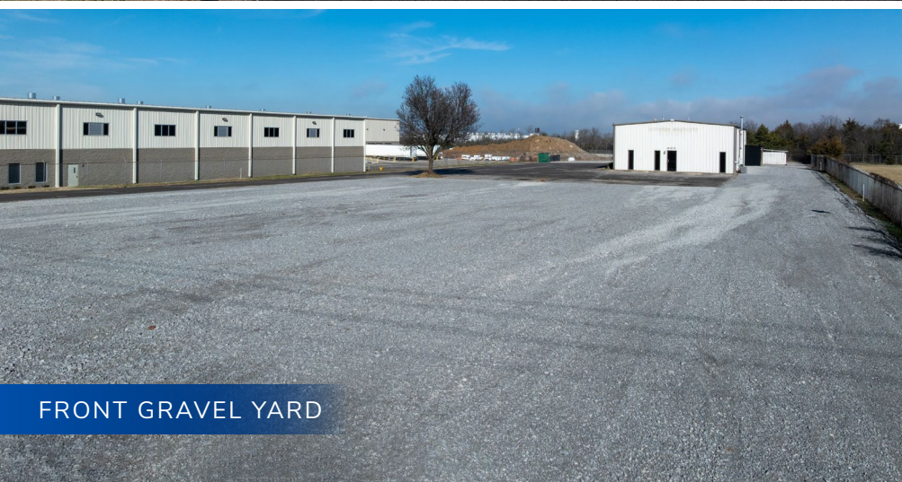
FRONT GRAVEL YARD