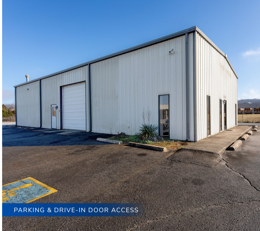
PARKING & DRIVE-IN DOOR ACCESS