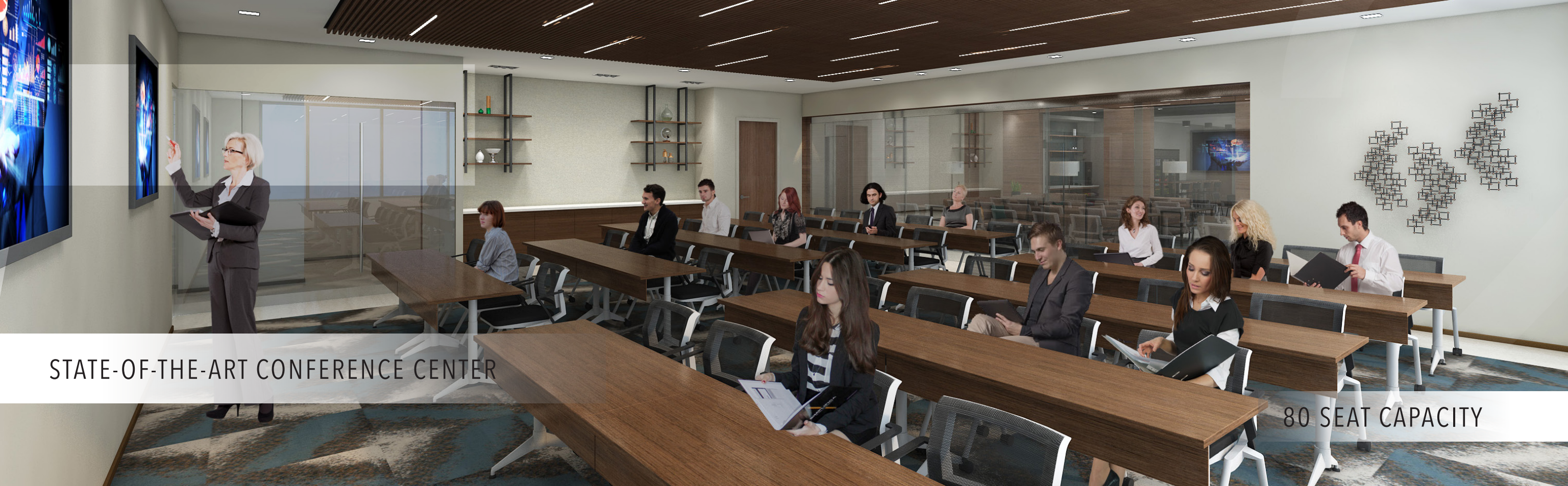
STATE-OF-THE-ART CONFERENCE CENTER