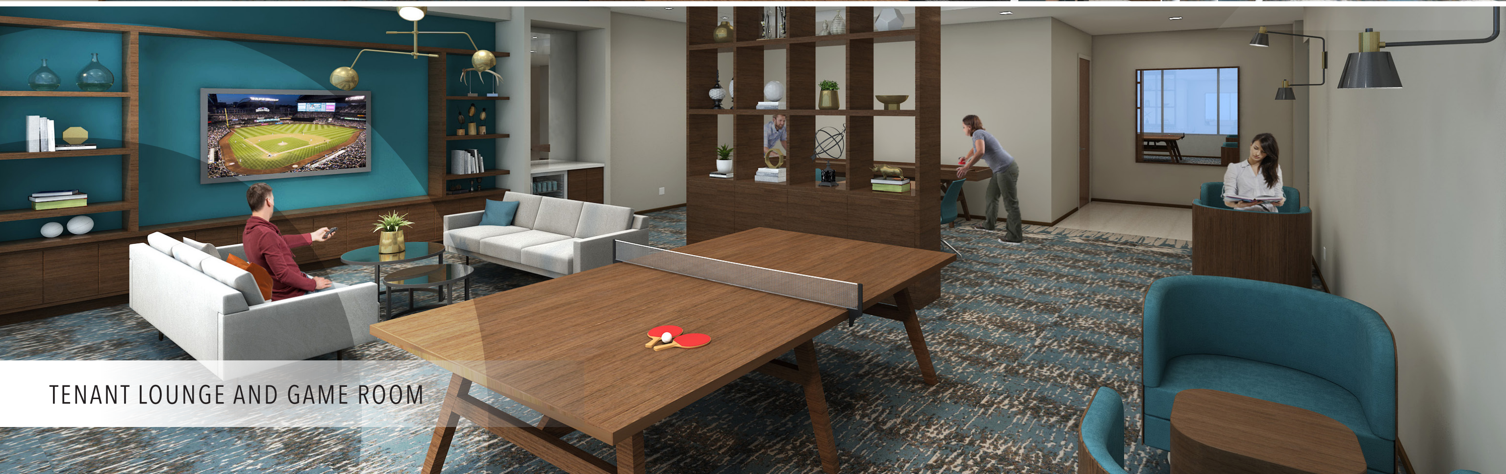
TENANT LOUNGE AND GAME ROOM