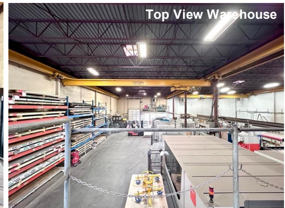
Top View Warehouse