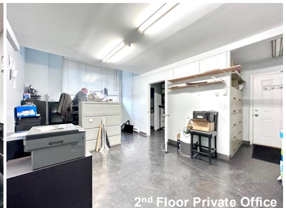
2 nd Floor Private Office