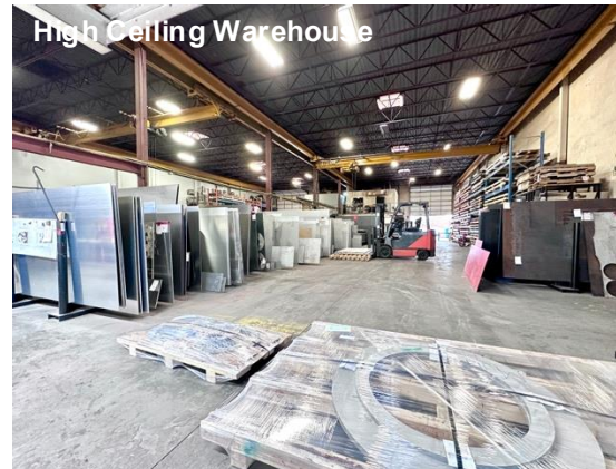
High Ceiling Warehouse