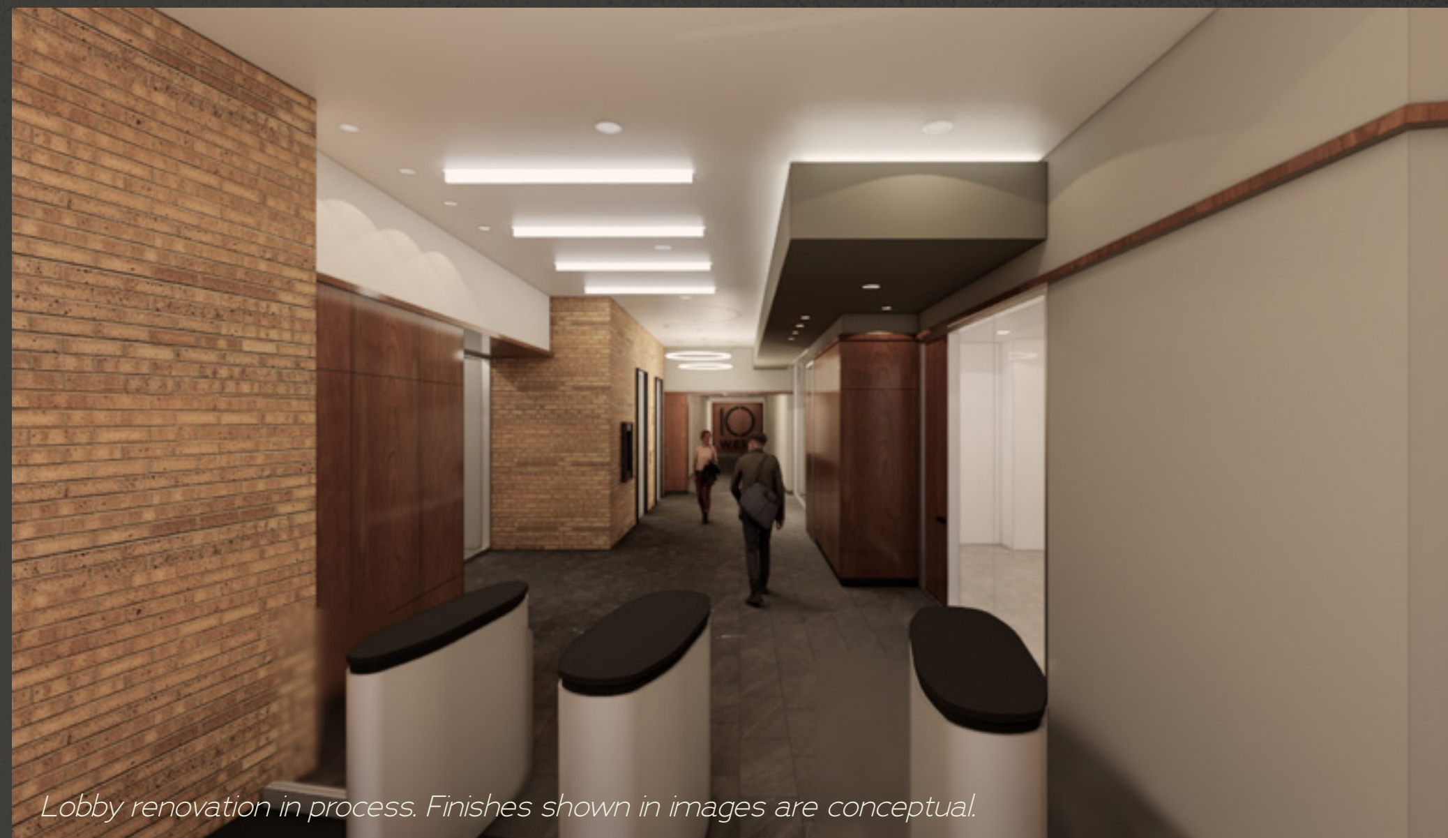
Lobby renovation in process. Finishes shown in images are conceptual.