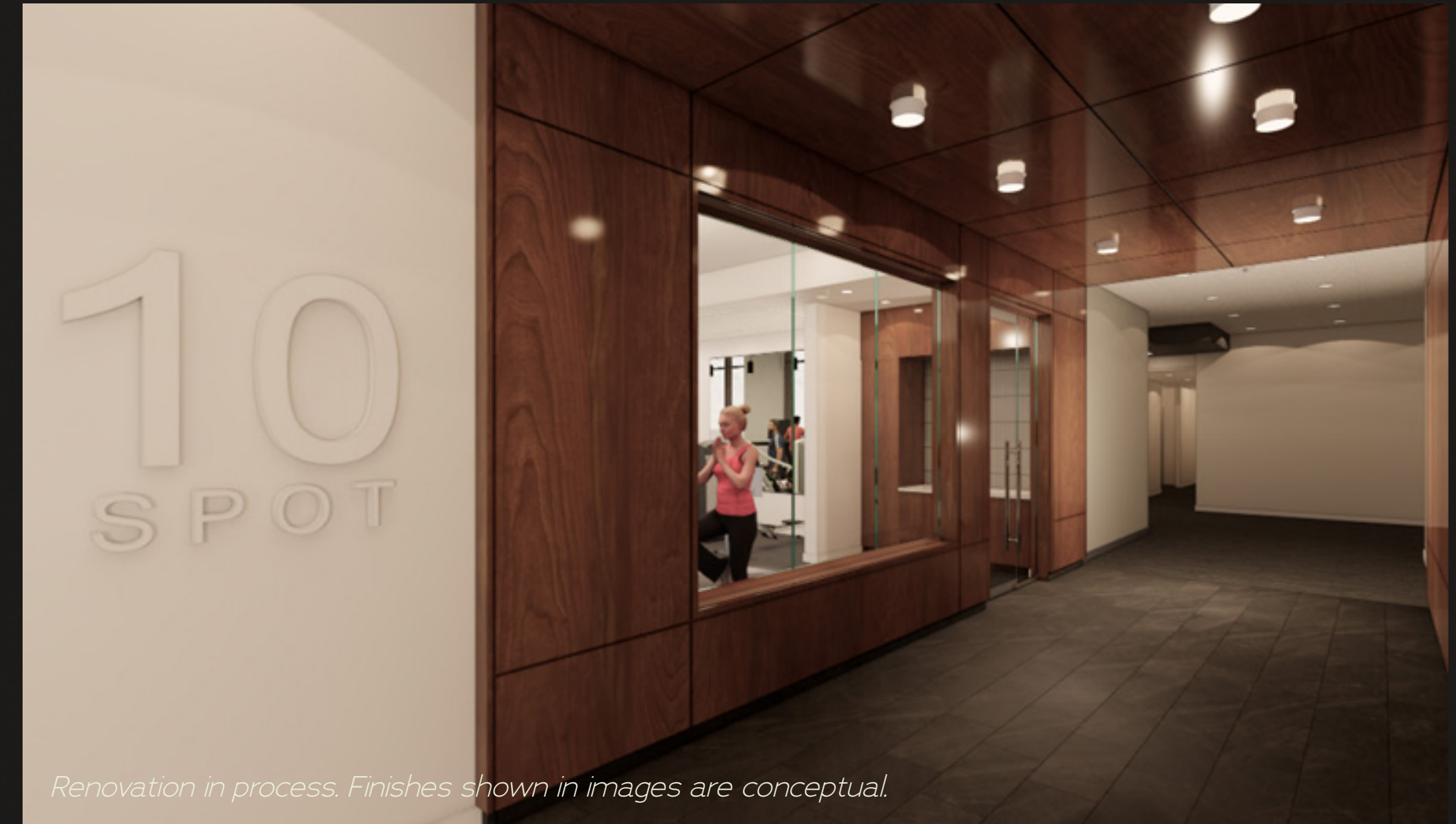
Renovation in process. Finishes shown in images are conceptual.

10 West is undergoing a transformative lobby renovation that reflects the building's flagship status in Downtown Columbus. Tenants will enjoy elevated design with premium finishes, modern conveniences, top-notch security, tenant identity opportunities, and exclusive amenities that set a new standard for office space in Columbus.