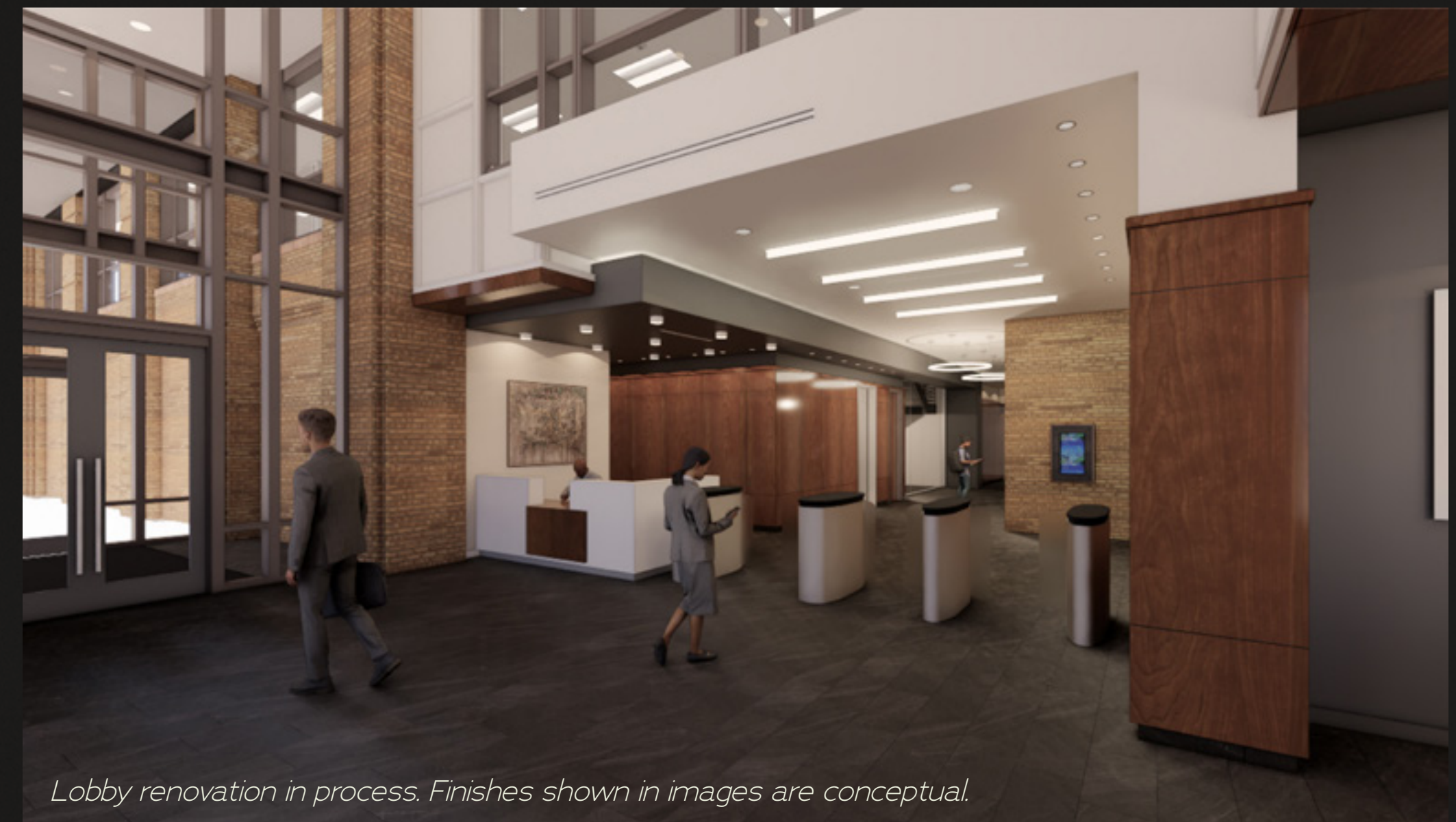
Lobby renovation in process. Finishes shown in images are conceptual.