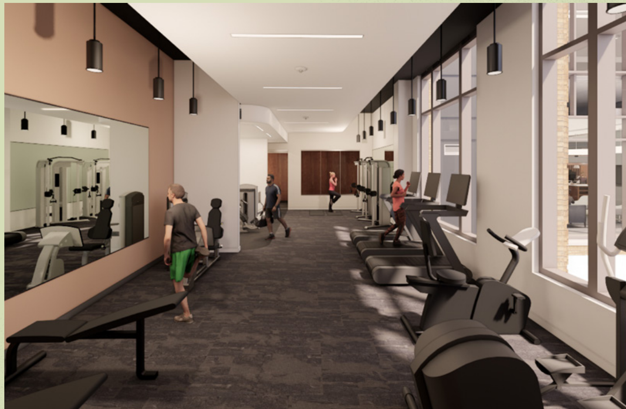
State-of-the-art fitness center