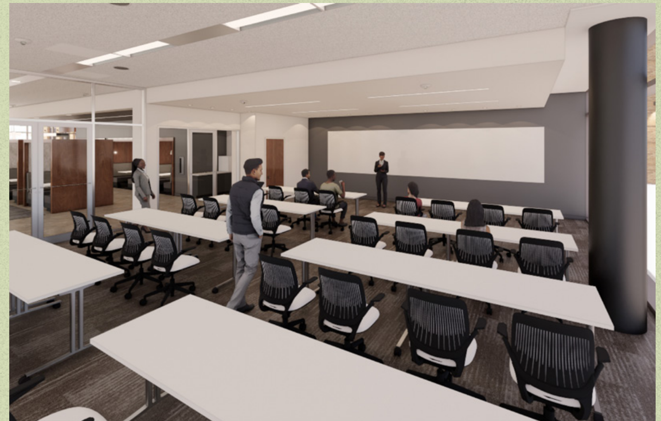
On-site conferencing center