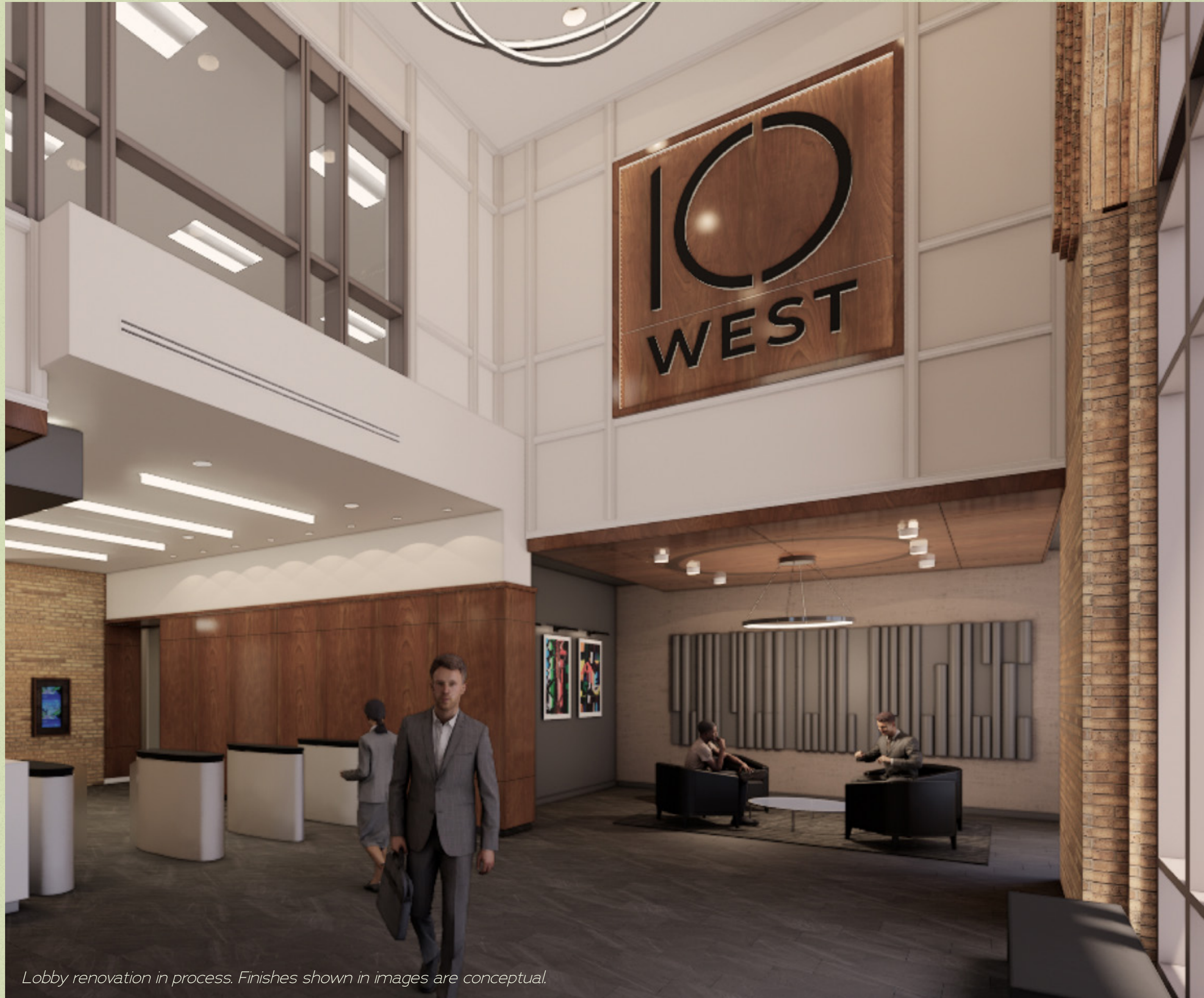
Lobby renovation in process. Finishes shown in images are conceptual.