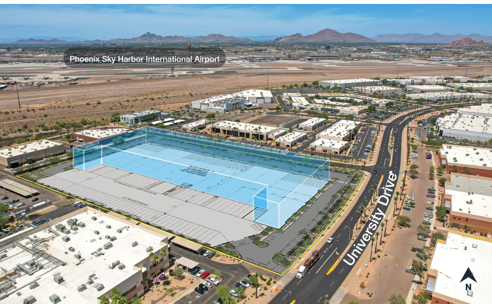
Phoenix Sky Harbor International Airport