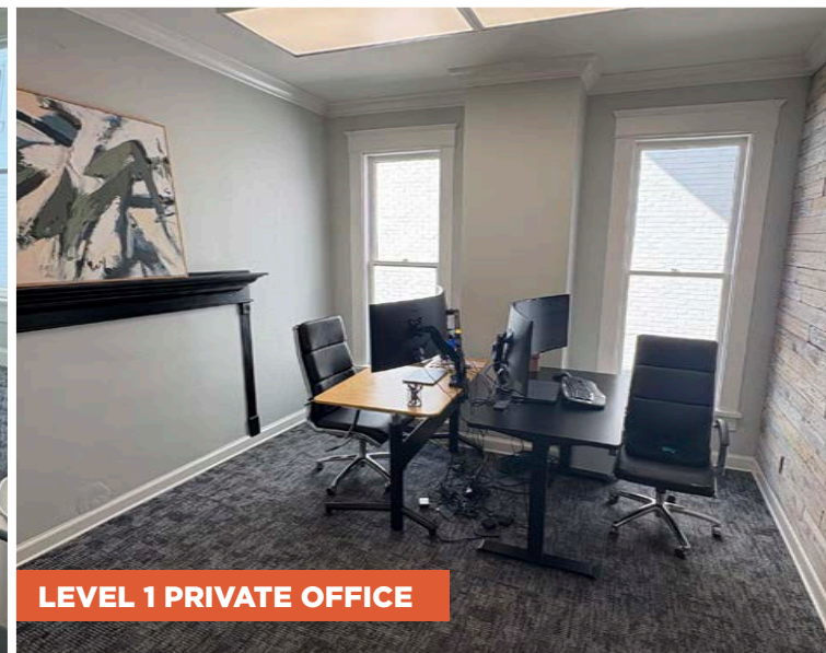
LEVEL 1 PRIVATE OFFICE