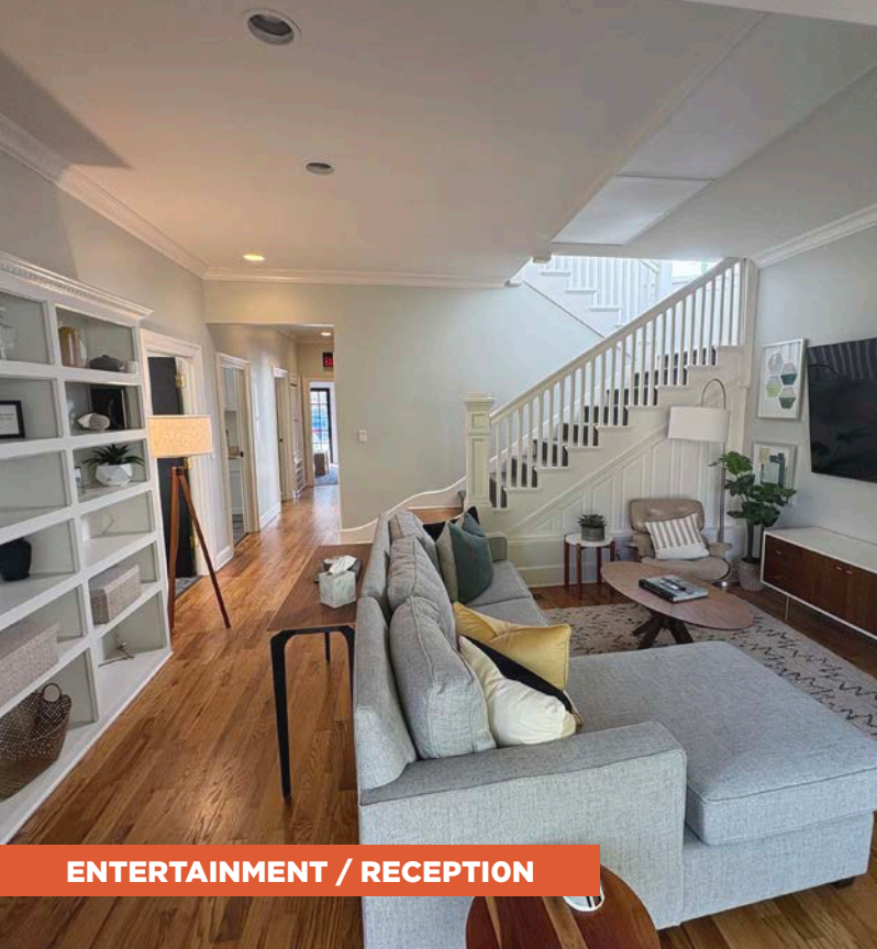
ENTERTAINMENT / RECEPTION