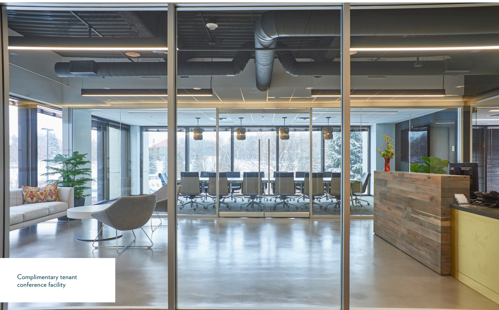
Complimentary tenant conference facility