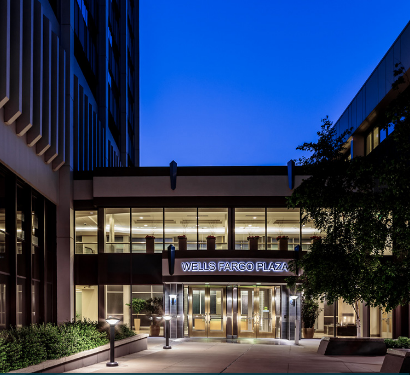
Impressive drive-up experience