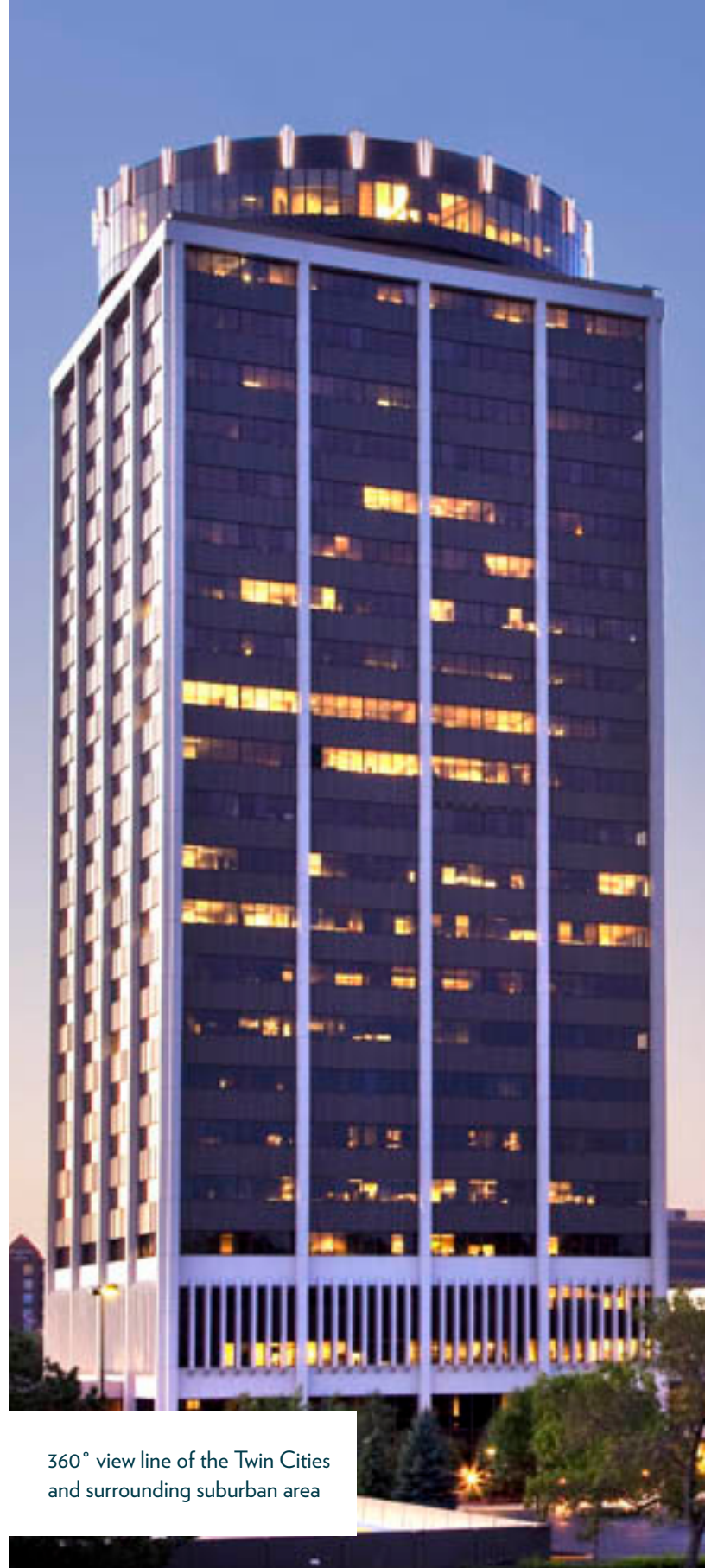
360° view line of the Twin Cities and surrounding suburban area

For leasing information, please contact: