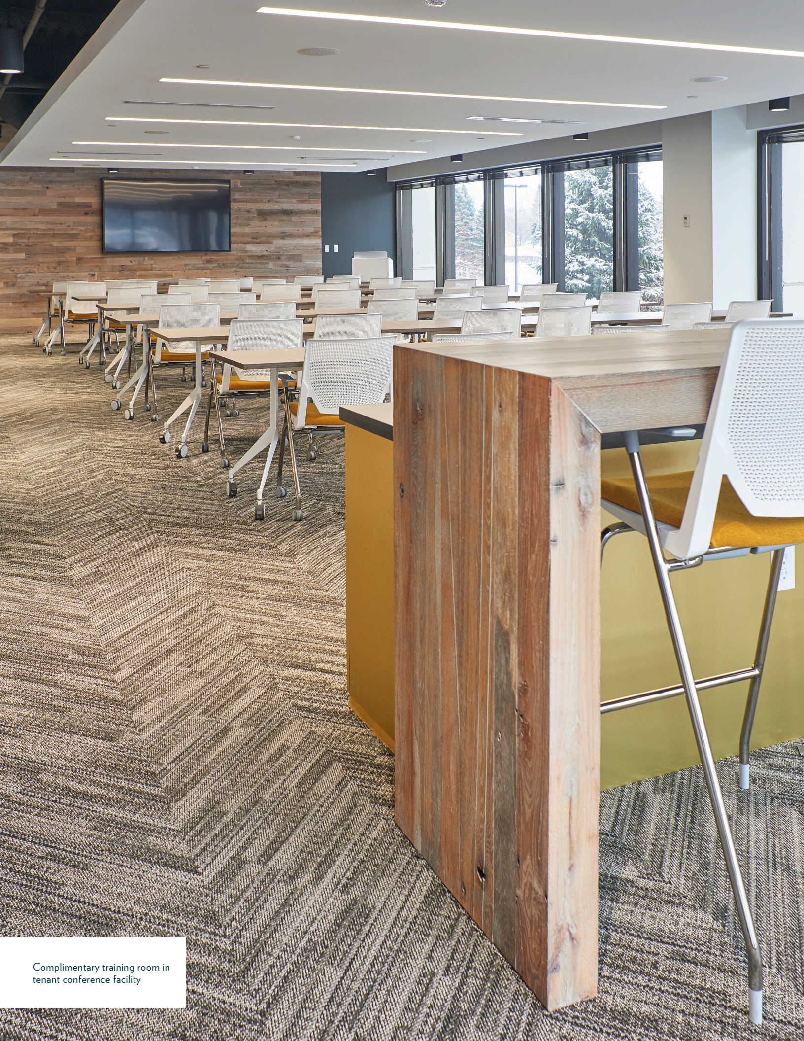
Complimentary training room in tenant conference facility