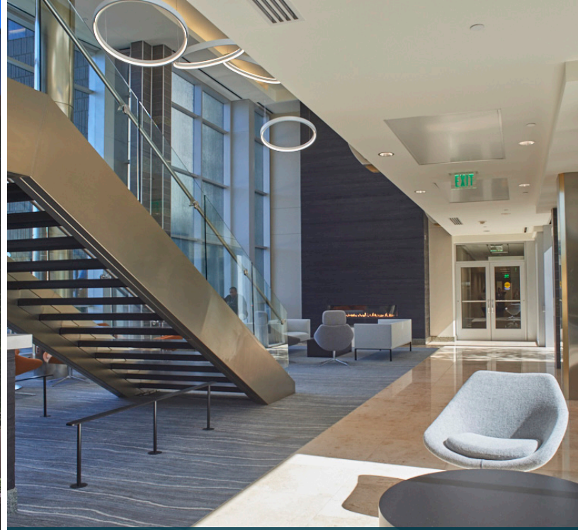
Grand 2-story lobby with 24-hour security

AMENITY-RICH. ACCESSIBLE TO ANYWHERE. ALL ABOUT THE VIEWS.