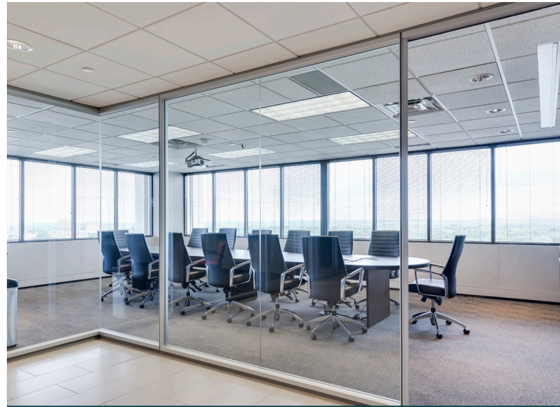
Class A neutral finishes throughout

For leasing information, please contact: