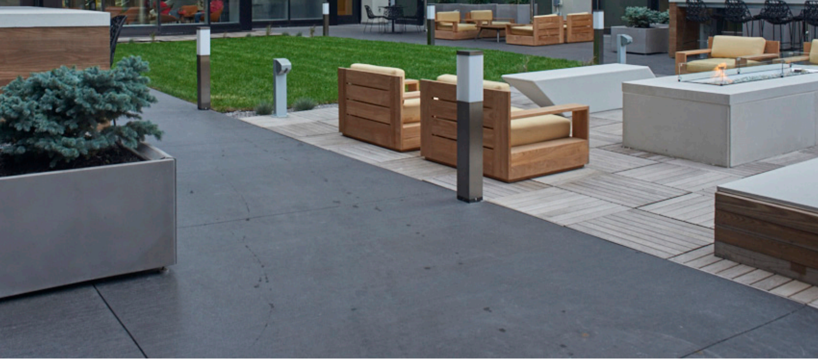
Towering high above Bloomington with 360° view lines