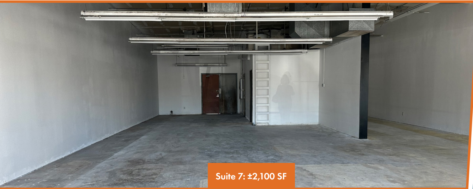
Suite 7: ±2,100 SF