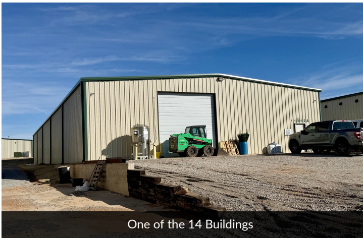
One of the 14 Buildings