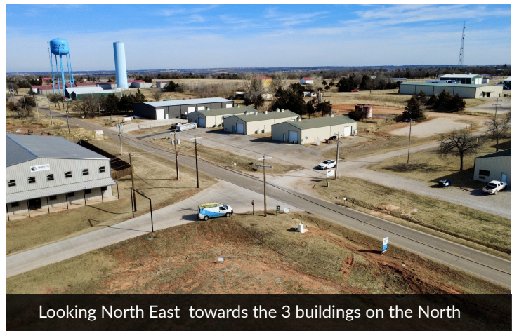
Looking North East towards the 3 buildings on the North

JOHNNY STRADAL 405.990.0569 johnny@creekcre.com