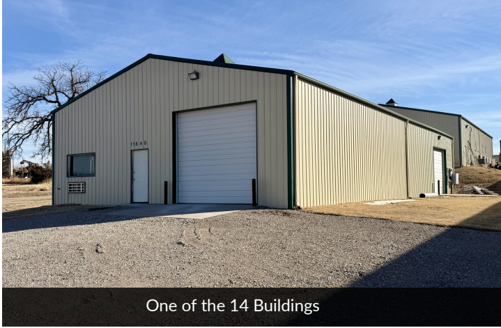
One of the 14 Buildings