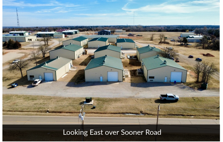
Looking East over Sooner Road