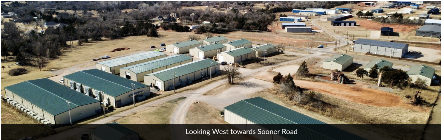
Looking West towards Sooner Road