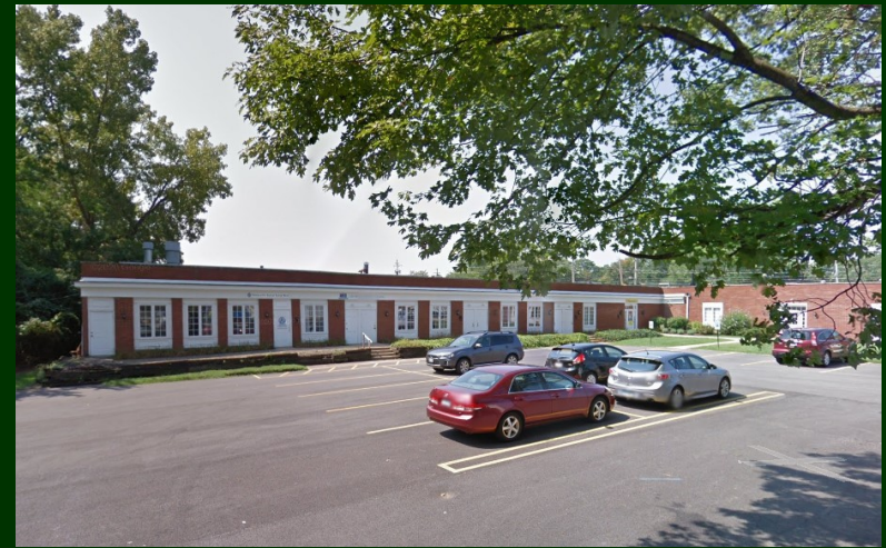
1701 Mentor Ave., Painesville Twp., OH 44077

No warranty or representation, express or implied, is made as to the accuracy of the information contained herein. It is submitted subject to errors, omissions, price changes, rental or other conditions, withdrawal without notice, and to any special listing conditions imposed by our client.