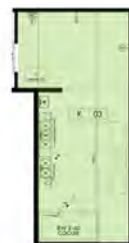
K3 - 386 SF