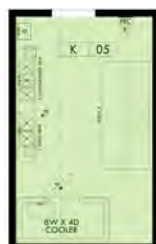
K5 - 243 SF