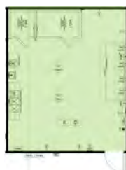
K1 - 763 SF

PREP® Scottsdale offers 12 private commercial food production kitchens.