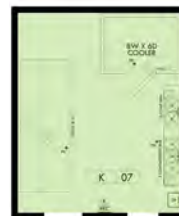
K7 - 328 SF