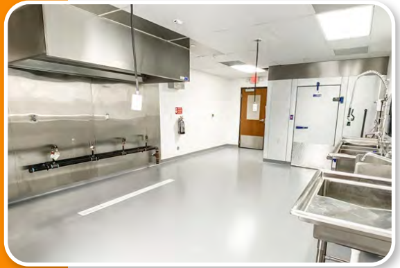
Photos are example photos from other PREP kitchens