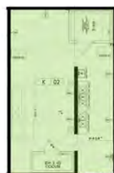
K2 - 570 SF