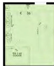
K6 - 324 SF