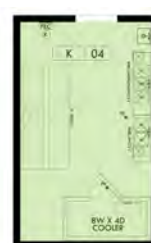
K4 - 243 SF