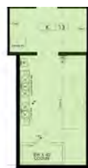
K13 - 326 SF