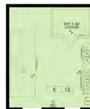
K10 - 328 SF