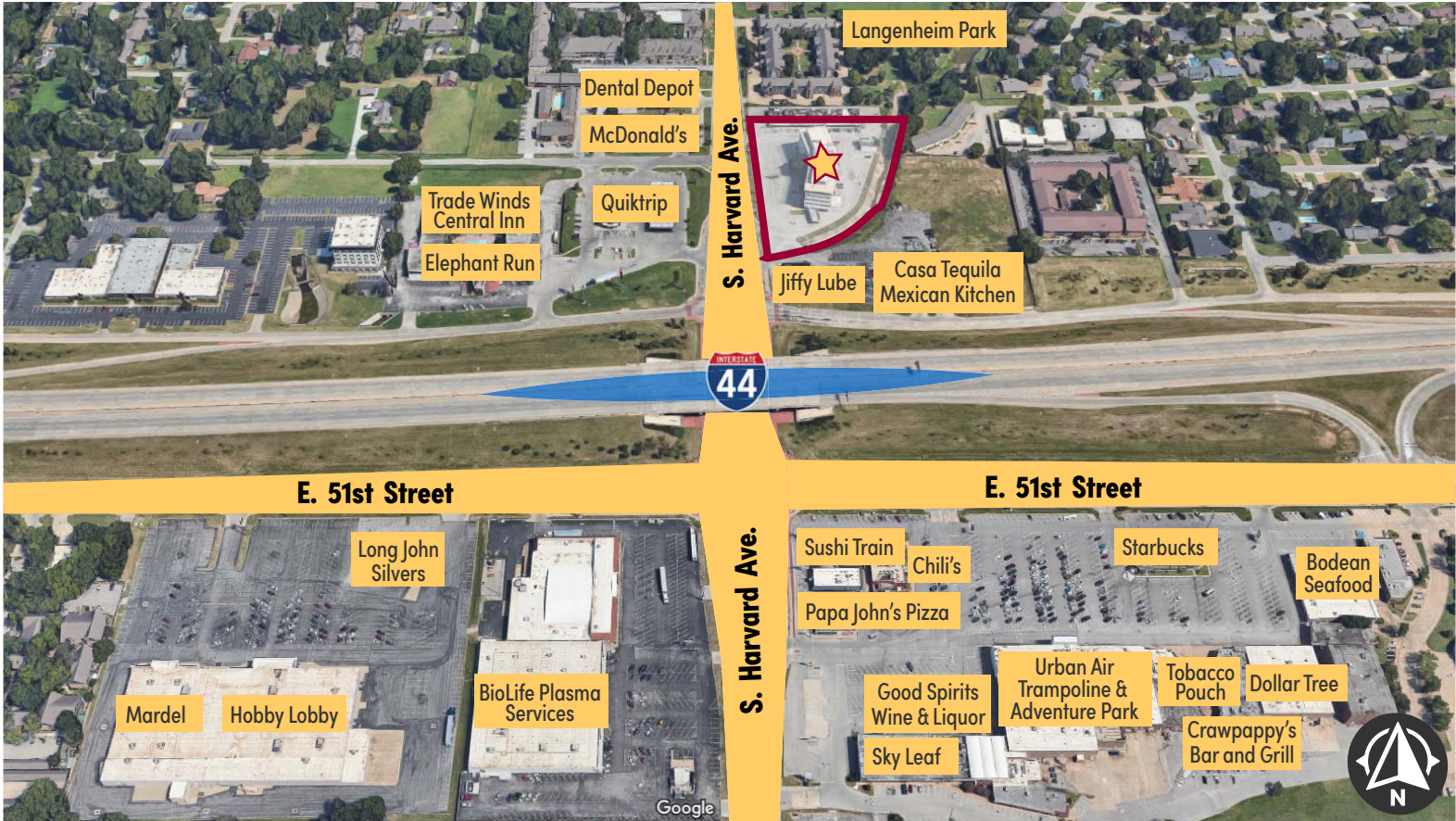
Greater Tulsa Area Map