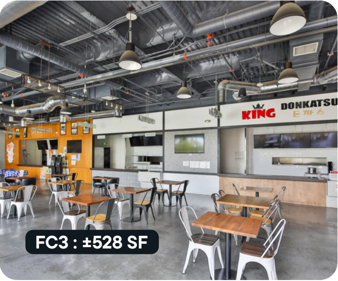
FC3 : ±528 SF