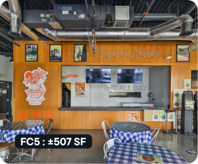
FC5 : ±507 SF