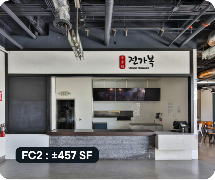
FC2 : ±457 SF