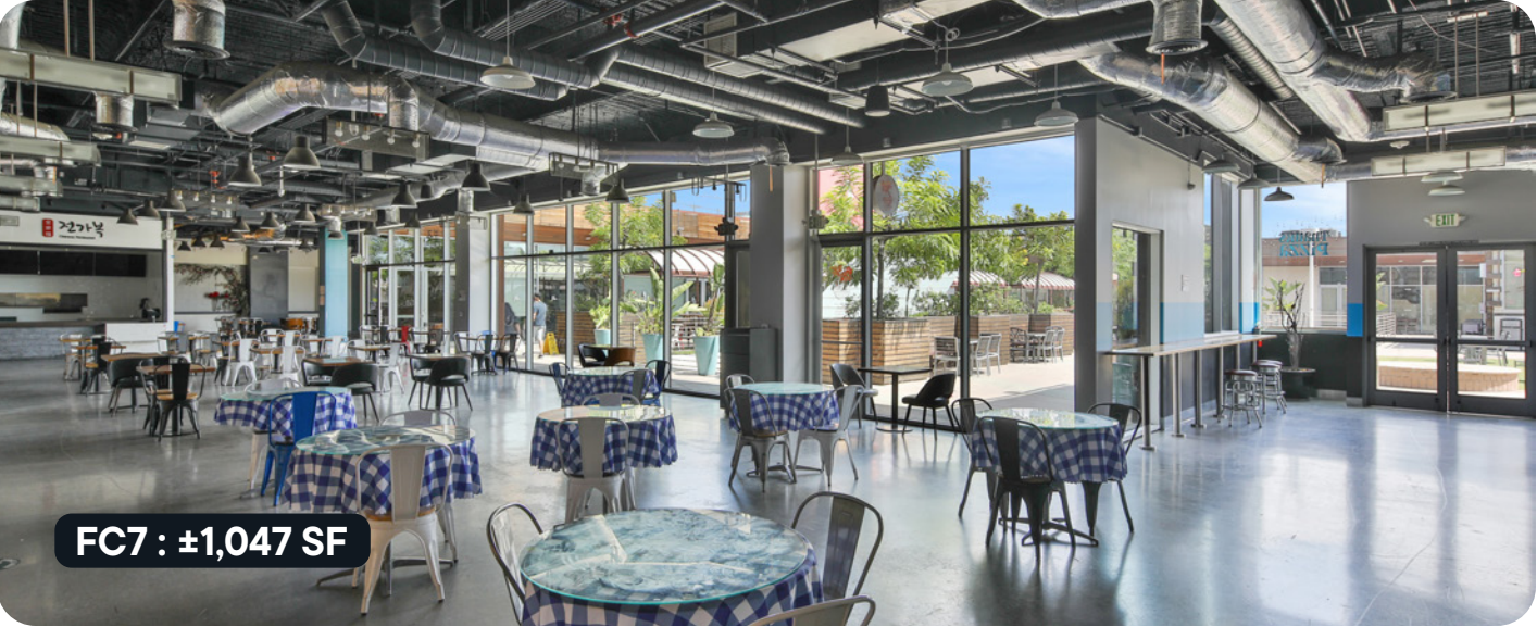
FC7 : ±1,047 SF