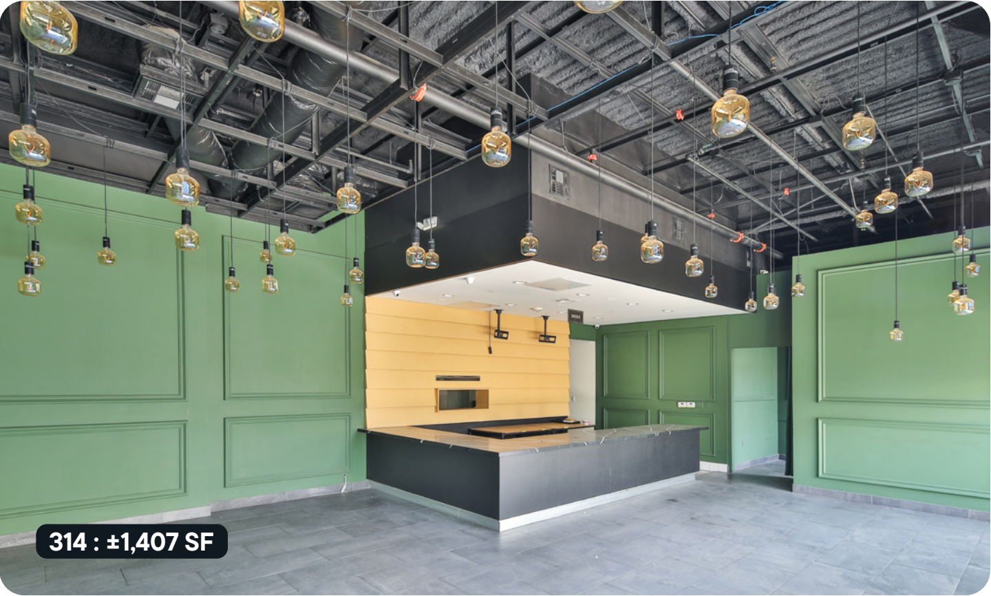
314 : ±1,407 SF