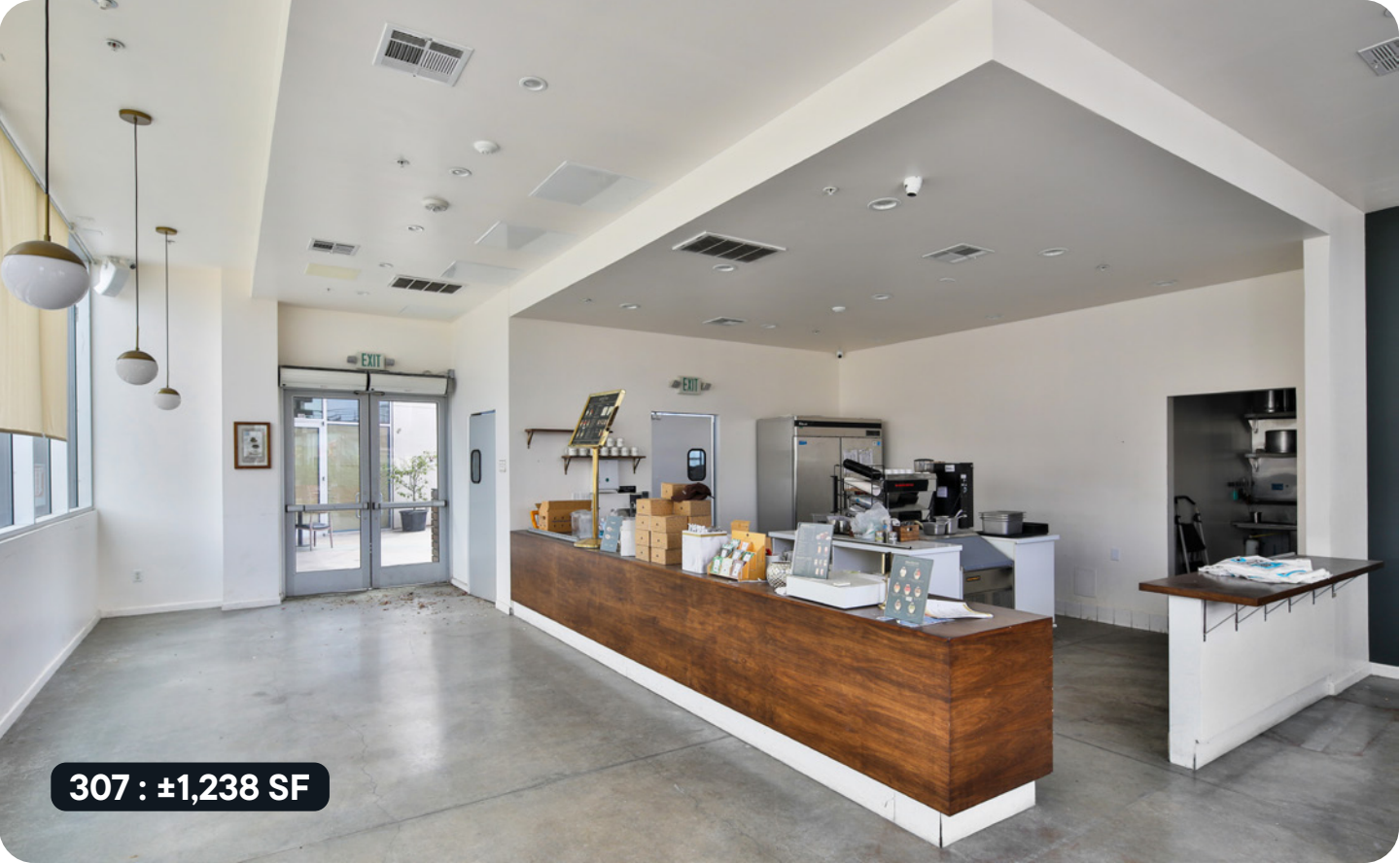
307 : ±1,238 SF