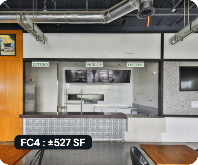
FC4 : ±527 SF