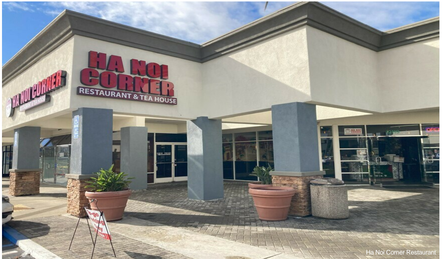
Ha Noi Corner Restaurant