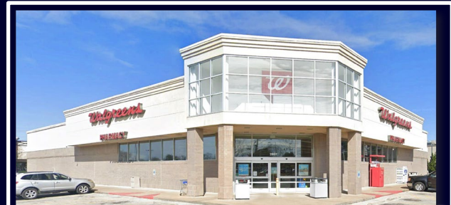
Available 14,000 SF | Freestanding BLDG w/Covered Drive-Up Window