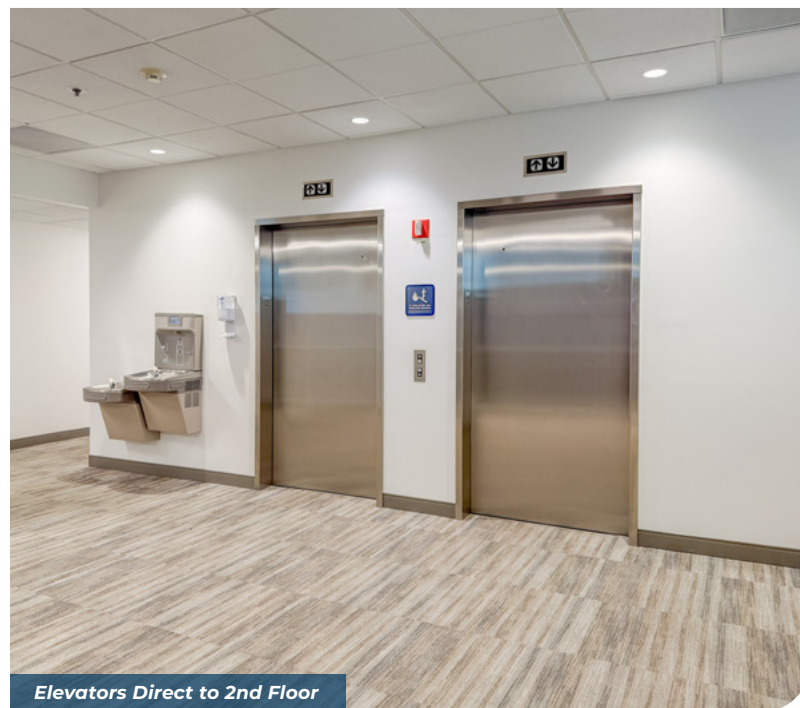
Elevators Direct to 2nd Floor