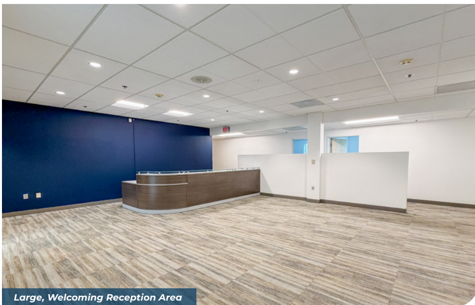
Large, Welcoming Reception Area