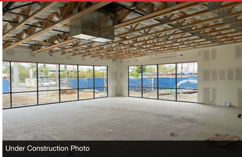
Under Construction Photo