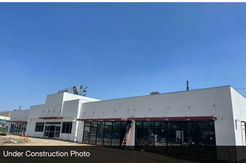
Under Construction Photo