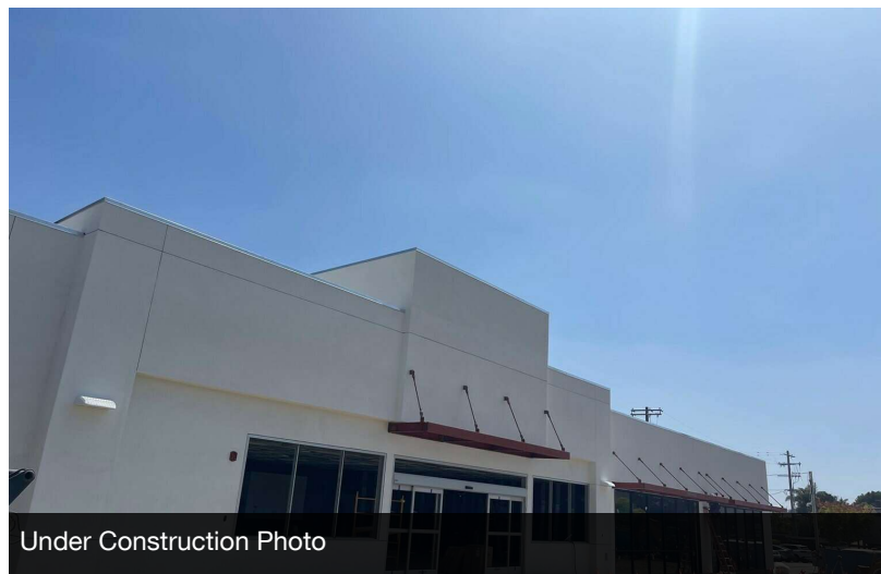
Under Construction Photo

No warranty, express or implied, is made as to the accuracy of the information contained herein. This information is submitted subject to errors, omissions, change of price, rental or other conditions, withdrawal without notice, and is subject to any special listing conditions imposed by our principals. Cooperating brokers, buyers, tenants and other parties who receive this document should not rely on it, but should use it as a starting point of analysis, and should independently confirm the accuracy of the information contained herein through a due diligence review of the books, records, files and documents that constitute reliable sources of the information described herein. Logos are for identification purposes only and may be trademarks of their respective companies. NAI Capital Commercial, Inc. CAL DRE Lic. #02130474