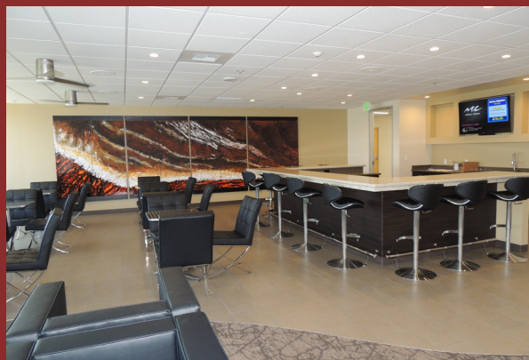
Luxury Multi-Purpose Meeting Spaces