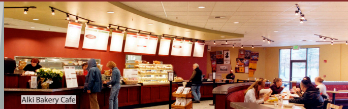
Alki Bakery Cafe