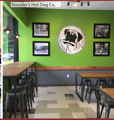
Skooder's Hot Dog Co.