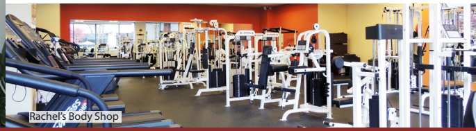
Rachel's Body Shop