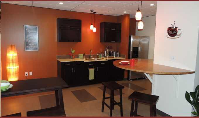
Bistro Inspired Breakrooms