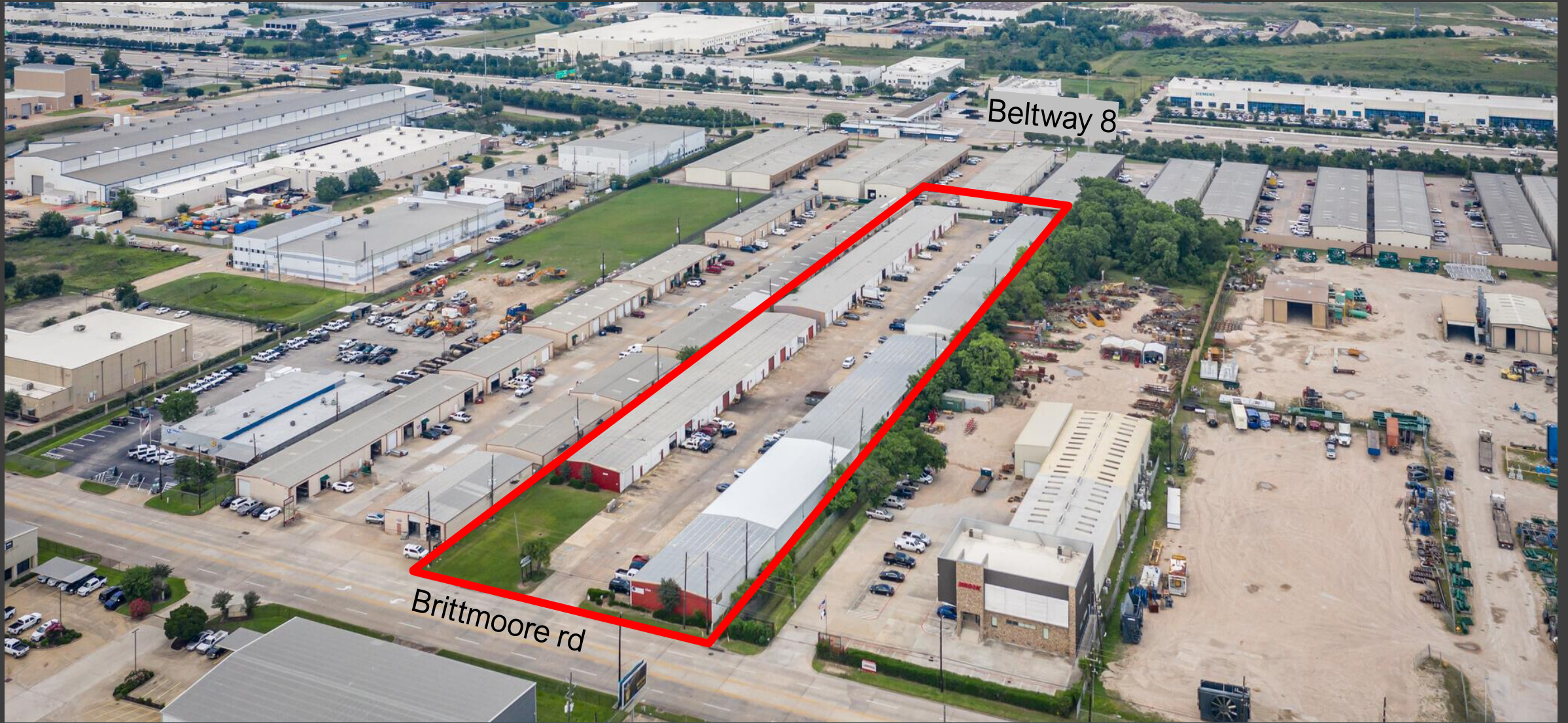
Property facing east. Only 1 mile to Beltway / 290 interchange.