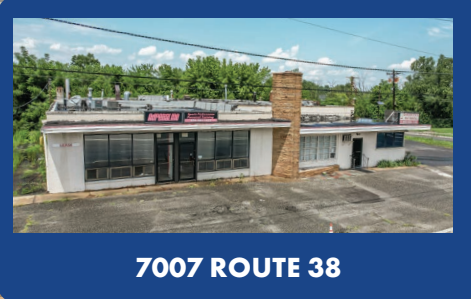
7007 ROUTE 38