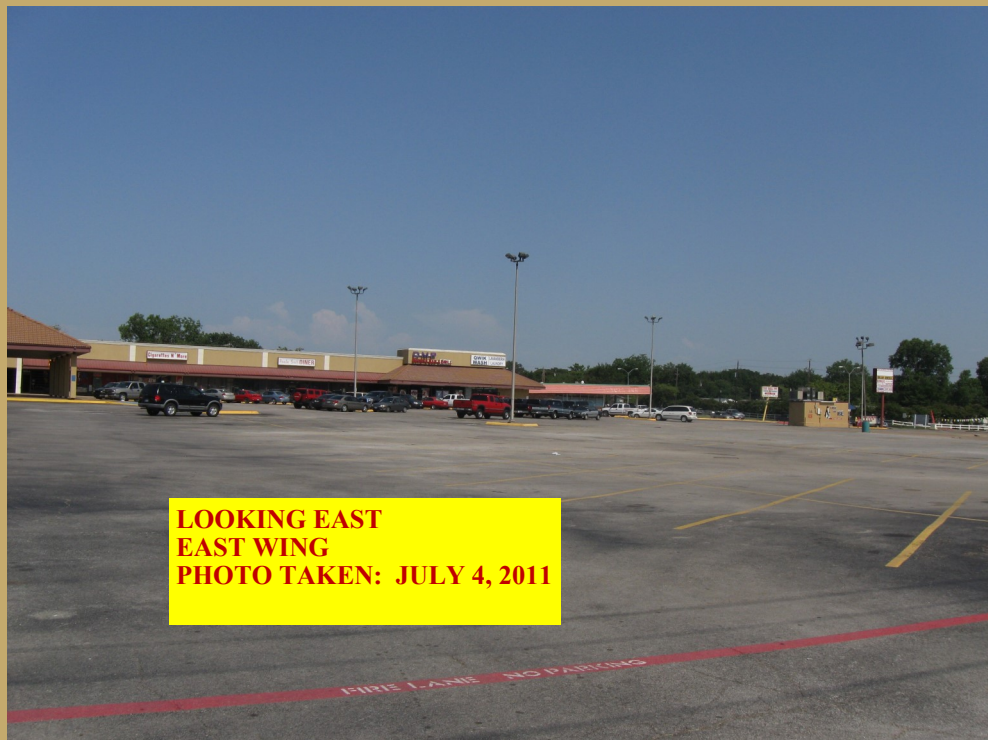
LOOKING EAST EAST WING PHOTO TAKEN: JULY 4, 2011