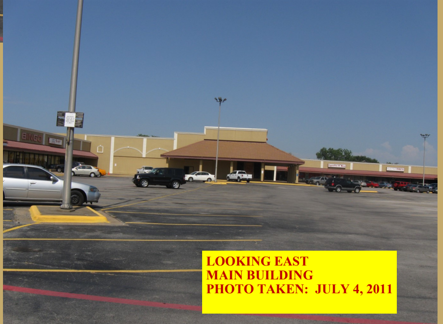
LOOKING EAST MAIN BUILDING PHOTO TAKEN: JULY 4, 2011