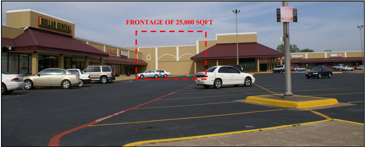
LAKE JUNE-HICKORY TREE PLAZA 11903 Lake June Rd., Balch Springs, Tx 75180

25,000 Sqft RETAIL ANCHOR 600 Yards from Super Wal-Mart