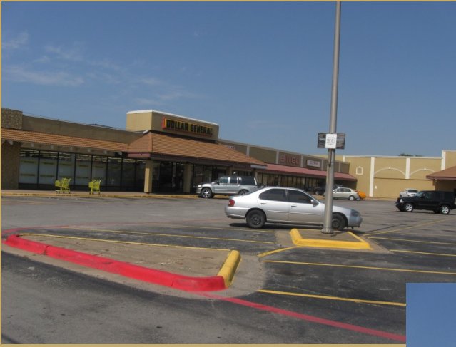
LOOKING NORTH- DOLLAR GENERAL PHOTO TAKEN: JULY 4, 2011