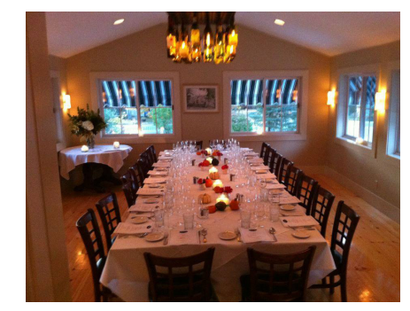
200 Shore Road, Ogunquit, ME. 03907 Offered at $3,300,000