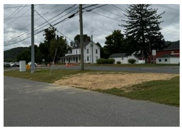
Located at signalized intersection