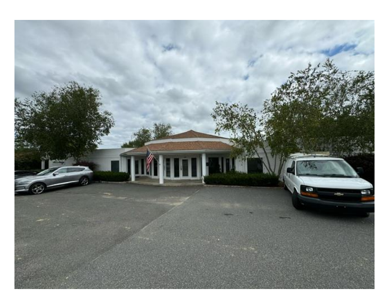
Main entrance of building