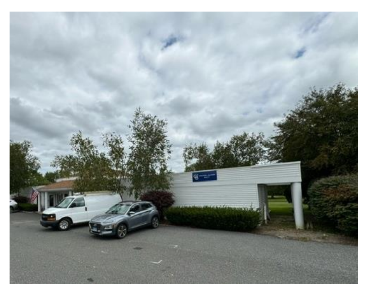
Coldwell Banker wing of building