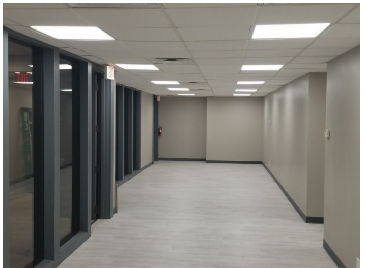
Tenant Finish Sample