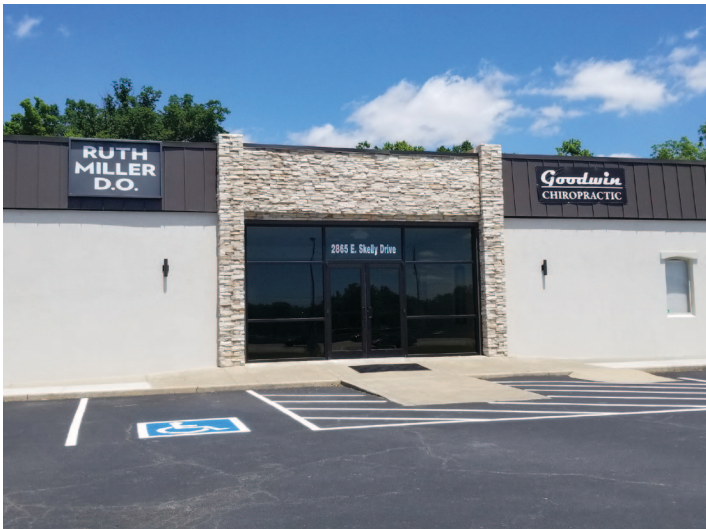
Building Front Entry