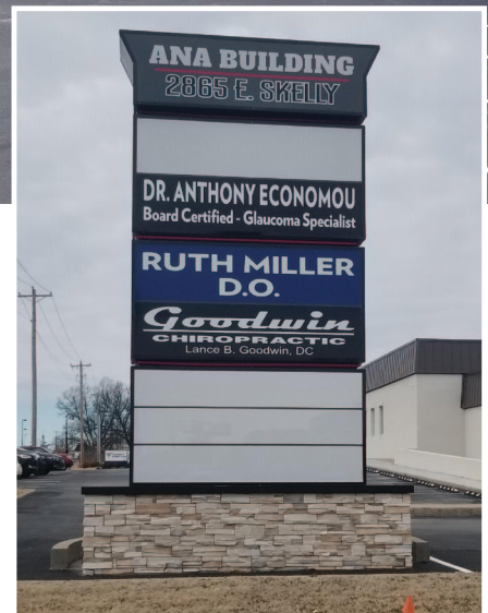
New Marquee Signage