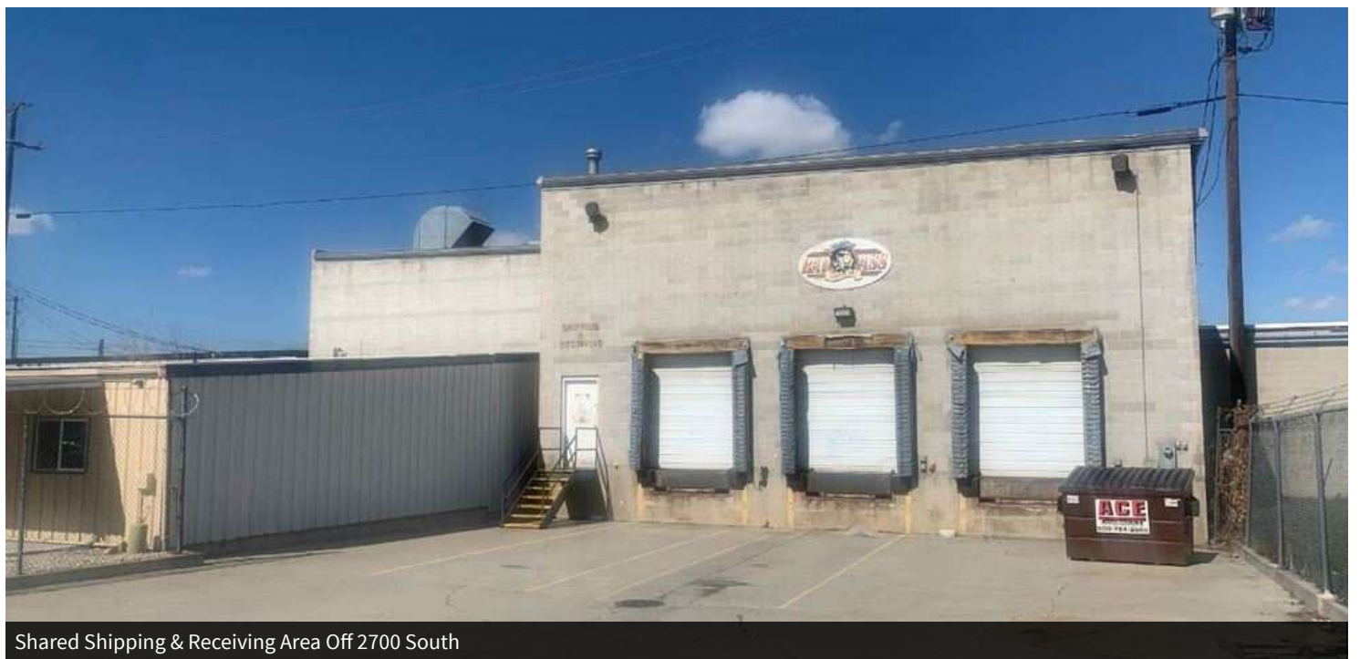
Shared Shipping & Receiving Area Off 2700 South

CHRISTIAN PRISKOS, CCIM 801.573.8500 christian@iproperties.com