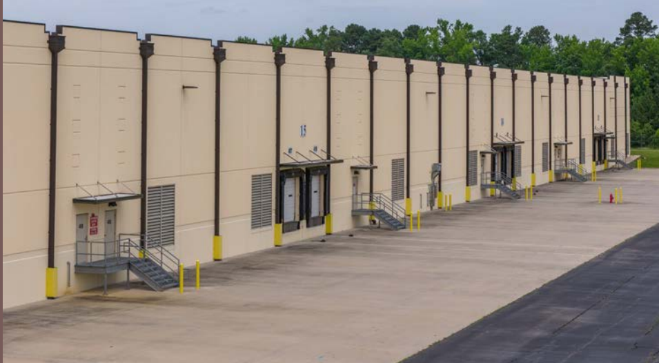
16 Dock Doors (additional knock outs available) with 185' truck courts