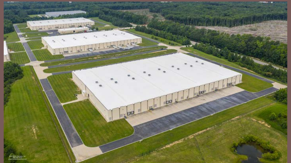
Potential ISO/additional parking