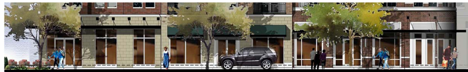
1 RESTAURANT 2 - MAIN STREET ELEVATION SCALE: NTS