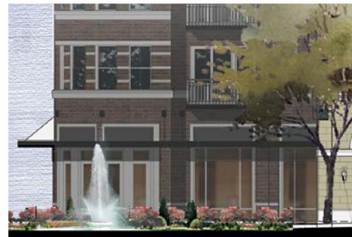
4 RESTAURANT 2 - BURLINGTON ELEVATION SCALE: NTS