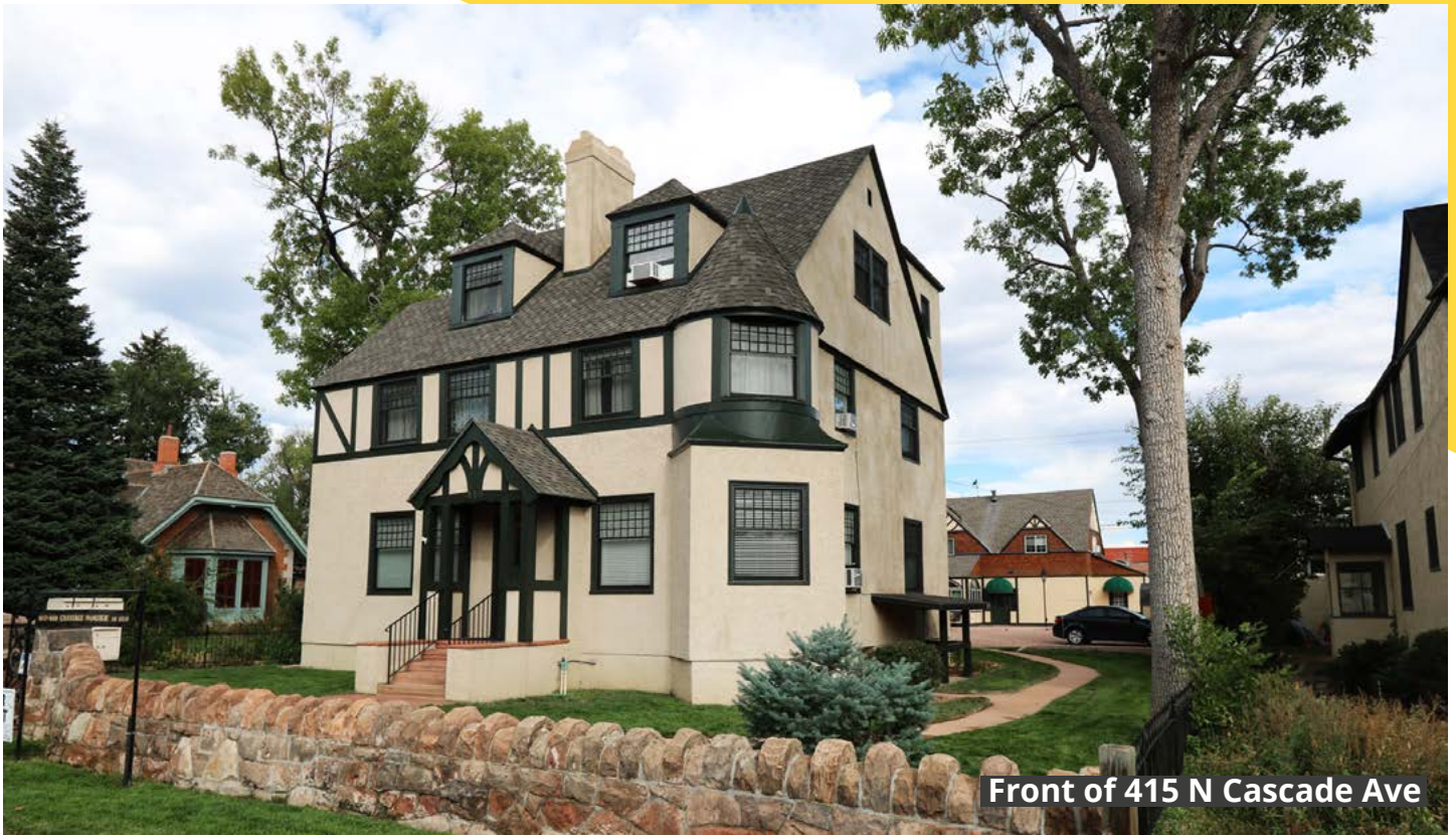
Front of 415 N Cascade Ave

415, 417 & 419 N Cascade Ave, Colorado Springs, CO 80903