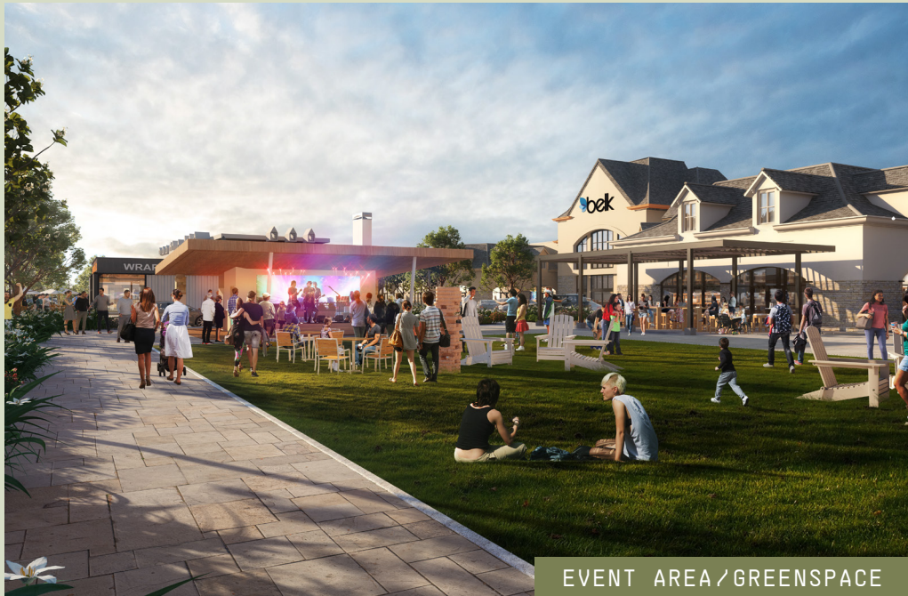
EVENT AREA / GREENSPACE