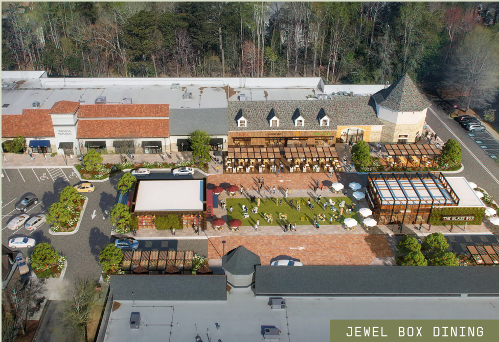
JEWEL BOX DINING