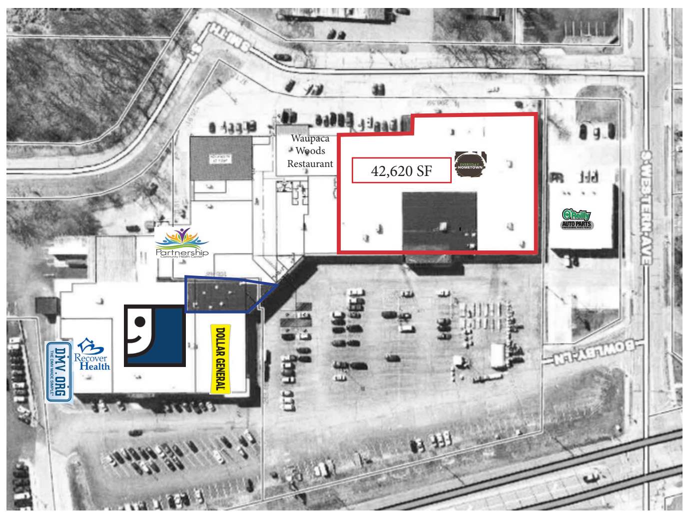
West Fulton Street (STH 49)

For Sale 825 W. Fulton Street Waupaca, WI.