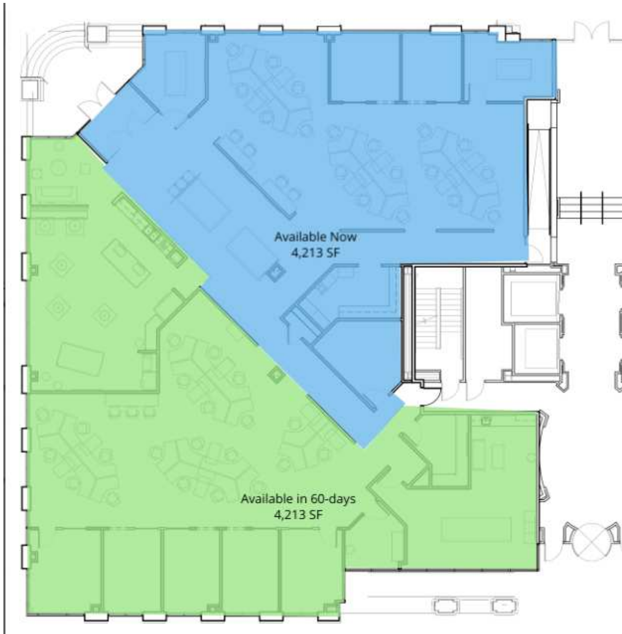
Suite 100 As-Built Plan