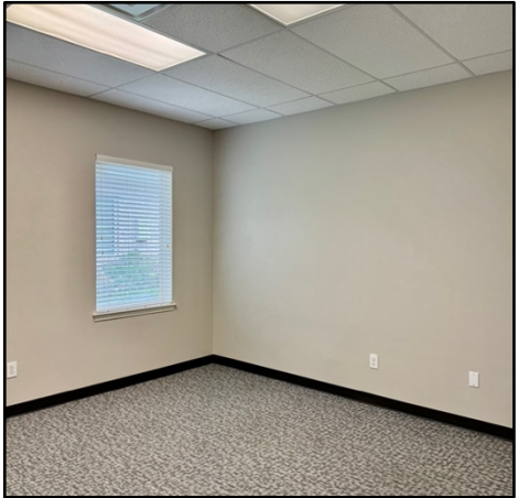
2651 Sagebrush Drive, Suite 116 Flower Mound, TX 1,002 RSF